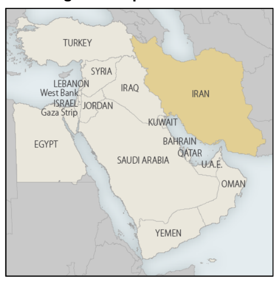
Figure 2. Map of Near East

Iran claims to be a Persian Gulf power with an 1.100-mile coastline on the Persian Gulf and Gulf of Oman. Exerting dominance over the Gulf has always been a key focus of Iran's foreign policy, including during the reign of the Shah. In 1981, citing a perceived threat from revolutionary Iran and spillover from the Iran-Iraq War that began in September 1980, six Gulf states—Saudi Arabia, Kuwait, Bahrain, Qatar, Oman, and the United Arab Emirates—formed the Gulf Cooperation Council alliance (GCC). U.S.-GCC security cooperation expanded throughout the remainder of the 1980-1988 Iran-Iraq War. After the 1990 Iraqi invasion of Kuwait, the defense cooperation became formalized as official agreements between the United States and several of the Gulf states. Prior to 2003, the extensive U.S. presence in the Gulf was in large part to contain Saddam Hussein's Iraq