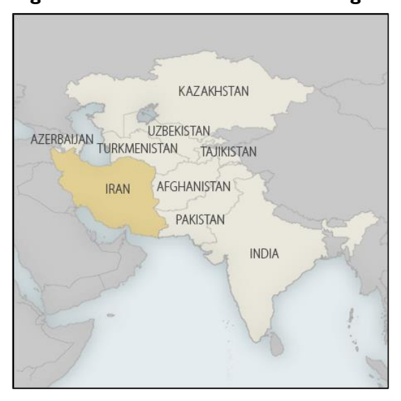
Figure 4. South and Central Asia Region

Azerbaijan is, like Iran, mostly Shia Musliminhabited. However, Azerbaijan is ethnically Turkic and its leadership is secular. Iran and Azerbaijan also have territorial differences over boundaries in the Caspian Sea, and Iran asserts that Azeri nationalism has stoked separatism among Iran's large Azeri population. Iran has generally tilted toward Armenia, which is Christian, in Armenia's