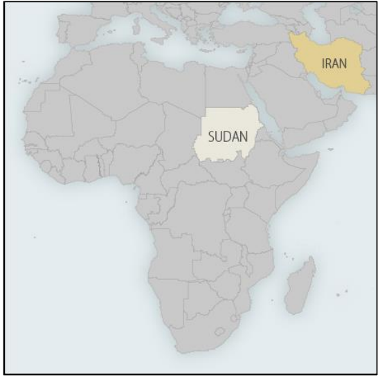
Figure 6. Sudan

The overwhelming majority of Muslims in Africa are Sunni, and Muslim-majority African countries have tended to be responsive to financial and diplomatic overtures from Iran's rivals in the GCC. West Africa's large Lebanese diaspora communities may also be a target of Iranian influence operations and a conduit for Hezbollah financial and criminal activities.