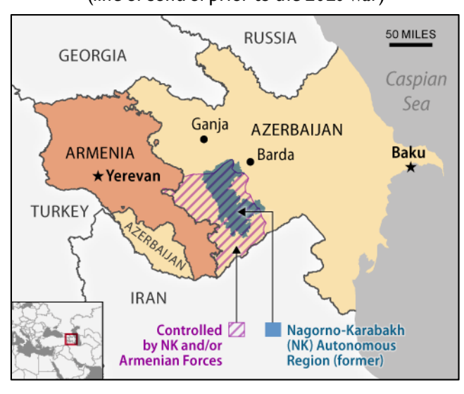
Figure 1. Armenia and Azerbaijan (line of control prior to the 2020 war)

The political and demographic history of Nagorno-Karabakh is fiercely contested. The region's majority ethnic Armenian population claims a dominant historical presence in Nagorno-Karabakh. In the latter half of the 18th century, the region became the center of the larger Karabakh khanate, a semi-independent Turkic (early Azerbaijani) principality formally subordinated to Iran before it was conquered by the Russian Empire in the early 19th century. By 1832, according to one scholar of the region, Armenians "constituted an overwhelming majority of the population" in the highland territory of Nagorno-Karabakh and made up about one-third of the population in the larger territory that was previously part of the former Karabakh khanate.<sup>2</sup>