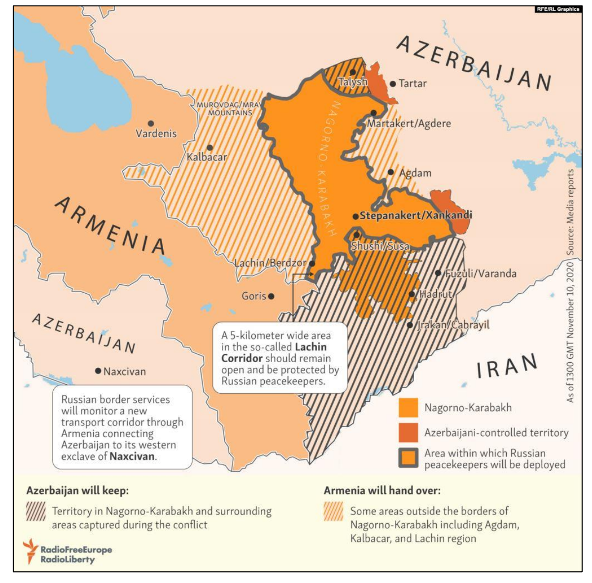
Figure 3. Cease-Fire Agreement of November 9, 2020