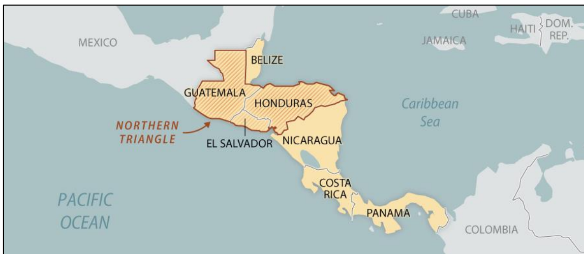
Figure 3. Map of Central America

The Northern Triangle region of Central America (see Figure 3 ) has received considerable attention from U.S. policymakers over the past decade, as it has become a major transit corridor for illicit drugs and has surpassed Mexico as the largest source of irregular migration to the United States. In FY2019, for example, U.S. authorities apprehended nearly 608,000 unauthorized migrants from El Salvador, Guatemala, and Honduras at the southwest border; 81% of those apprehended were families or unaccompanied minors, many of whom were seeking asylum. 79 These narcotics and migrant flows are the latest symptoms of deep-rooted challenges in the region, including widespread insecurity, fragile political and judicial systems, and high levels of poverty. The COVID-19 pandemic and two Category 4 hurricanes exacerbated conditions in the region in 2020, contributing to higher levels of unemployment and food insecurity while creating opportunities for governments to curtail civil liberties and engage in corruption.