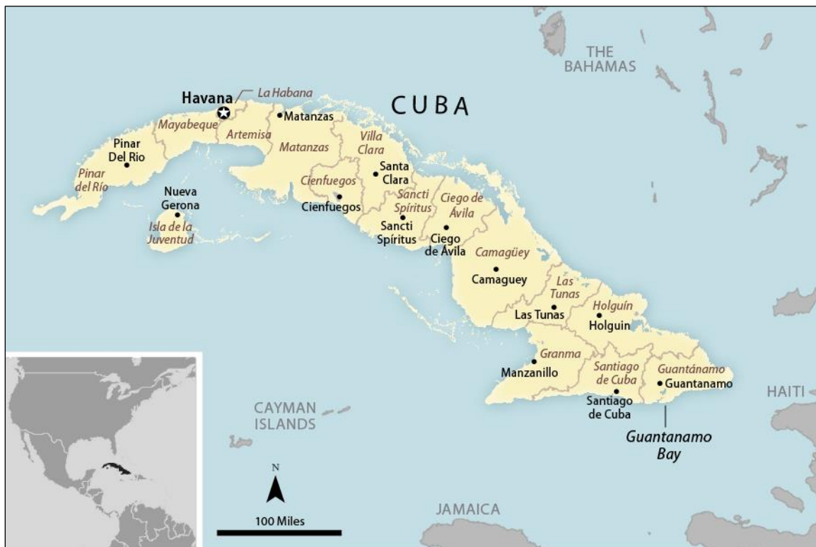
Figure 1. Provincial Map of Cuba

Since 2019, the Trump Administration has significantly expanded U.S. economic sanctions on Cuba by reimposing many restrictions eased under the Obama Administration and imposing a series of strong sanctions designed to pressure the government on its human rights record and for its support for the Nicolás Maduro government in Venezuela. These actions have included allowing lawsuits against those trafficking in property confiscated by the Cuban government, tightening restrictions on U.S. travel and remittances to Cuba, and engaging in efforts to stop Venezuelan oil exports to Cuba.