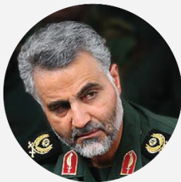
IRGC Major General Qasem Soleimani