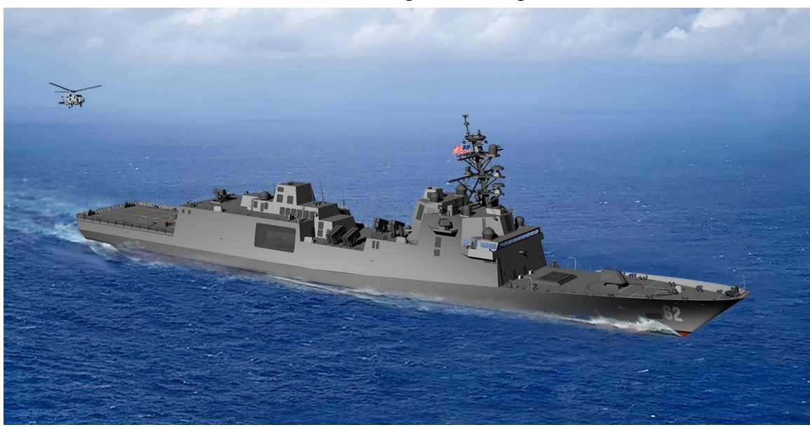
Figure 4. Oliver Hazard Perry (FFG-7) Class Frigate