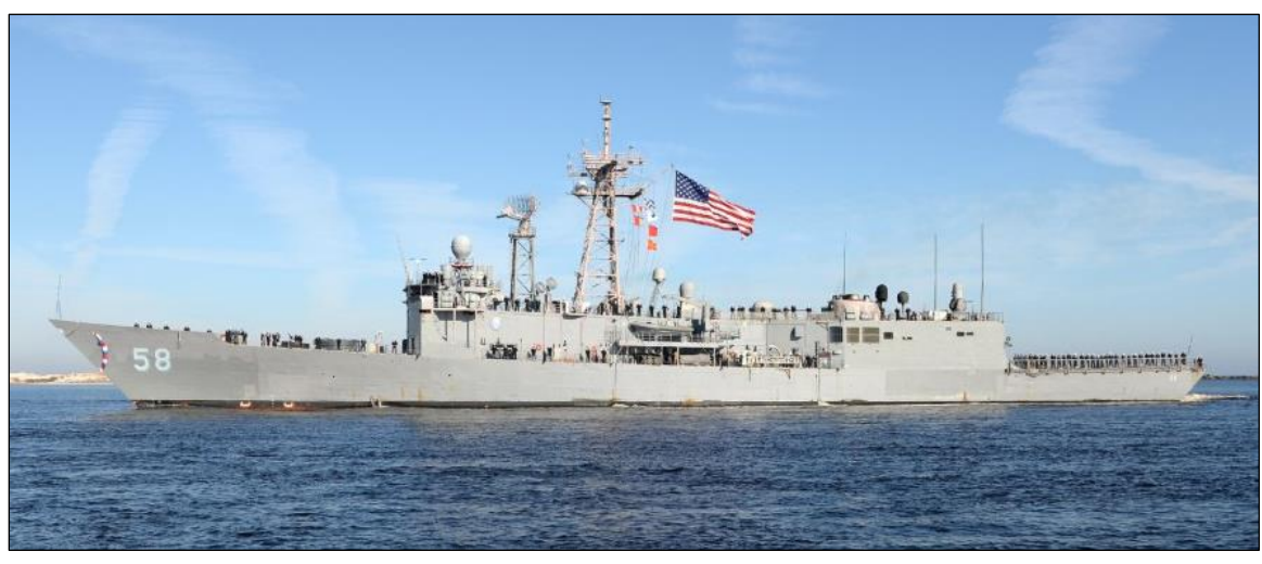
Figure 1. Oliver Hazard Perry (FFG-7) Class Frigate

The most recent class of frigates operated by the Navy was the Oliver Hazard Perry (FFG-7) class ( Figure 1 ). A total of 51 FFG-7 class ships were procured between FY1973 and FY1984. The ships entered service between 1977 and 1989, and were decommissioned between 1994 and 2015. In their final configuration, FFG-7s were about 455 feet long and had full load displacements of roughly 3,900 tons to 4,100 tons. (By comparison, the Navy's Arleigh Burke [DDG-51] class destroyers are about 510 feet long and have full load displacements of roughly 9,700 tons.) Following their decommissioning, a number of FFG-7 class ships, like certain other decommissioned U.S. Navy ships, have been transferred to the navies of U.S. allied and partner countries.