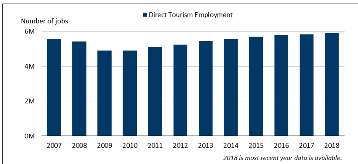
Figure 1. U.S. Travel and Tourism Industry Employment