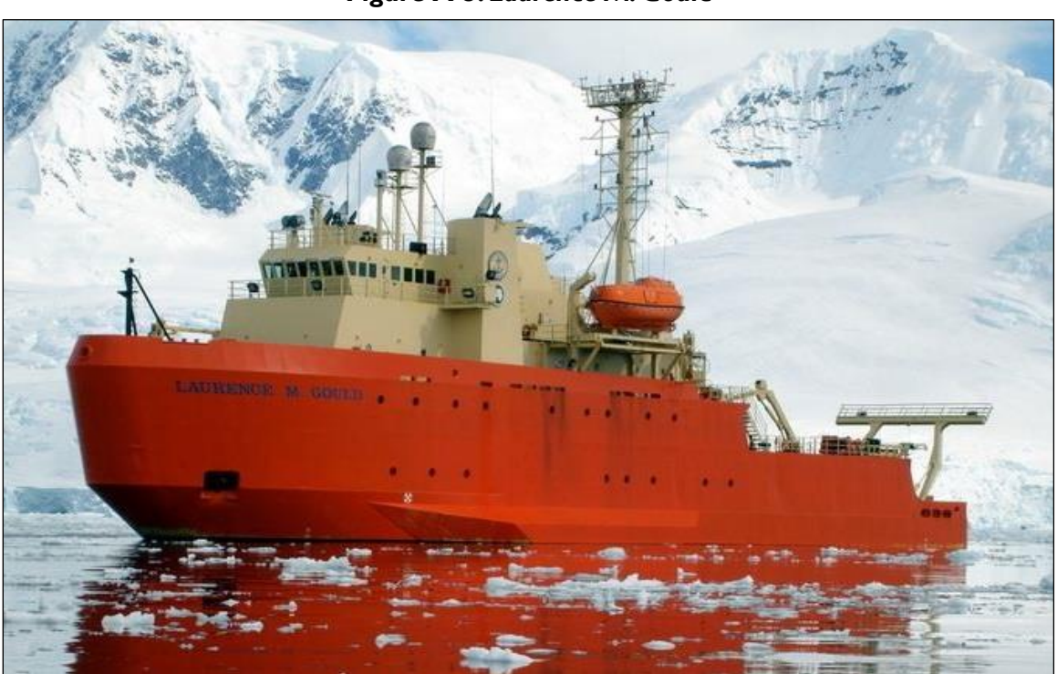
Figure A-5. Laurence M. Gould

Like Palmer , the polar research and supply ship Laurence M. Gould (Figure A-5) was built for NSF by North American Shipping. It was completed in 1997 and is operated for NSF on a long-term charter from ECO. It is 230 feet long and has a displacement of about 3,800 tons. It has a crew of 16 and can embark a scientific staff of 26 to 28 (with a capacity for 9 more in a berthing van). It can break ice up to 1 foot thick with continuous forward motion. Like Palmer , it was built to support NSF operations in the Antarctic, particularly operations at Palmer Station on the Antarctic Peninsula.