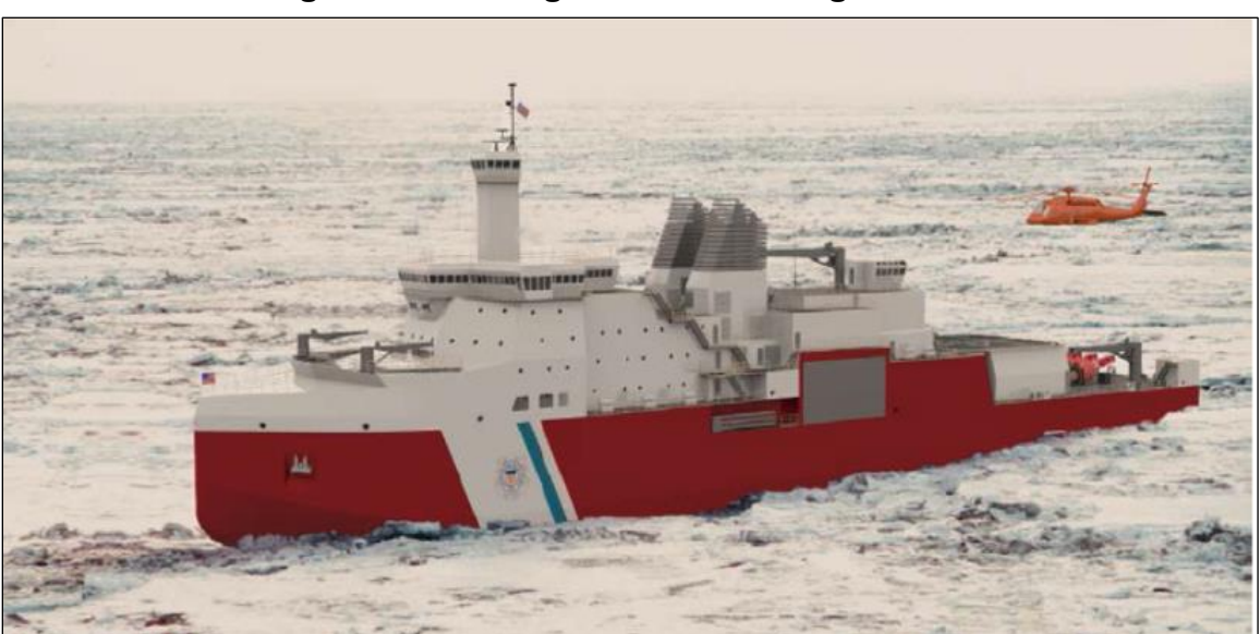
Figure 3. Rendering of VT Halter Design for PSC