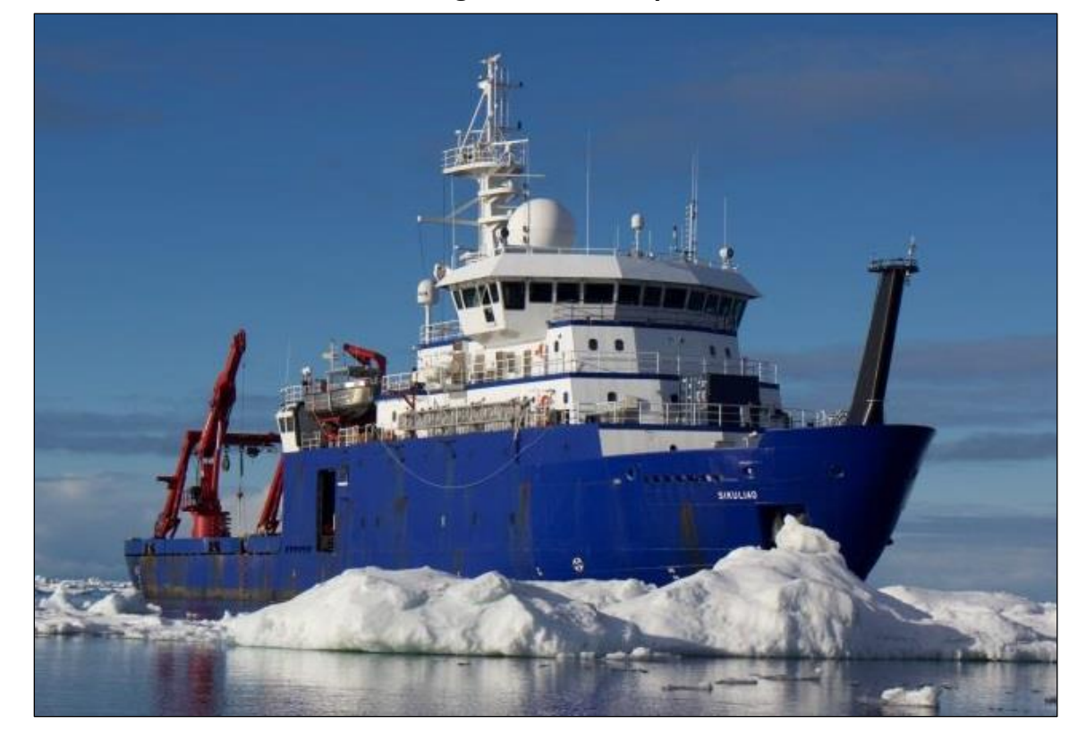
Figure A-6. Sikuliag

Sikuliaq (see-KOO-lee-auk; Figure A-6 ), which is used for scientific research in polar areas, was built by Marinette Marine of Marinette, WI, and entered service in 2015. It is operated for NSF by the College of Fisheries and Ocean Sciences at the University of Alaska Fairbanks as part of the U.S. academic research fleet through the University National Oceanographic Laboratory System (UNOLS). Sikuliaq is 261 feet long and has a displacement of about 3,600 tons. It has a crew of 22 and can embark an additional 26 scientists and students. The ship can break ice 2½ or 3 feet thick at speeds of 2 knots. The ship is considered less an icebreaker than an ice-capable research ship.