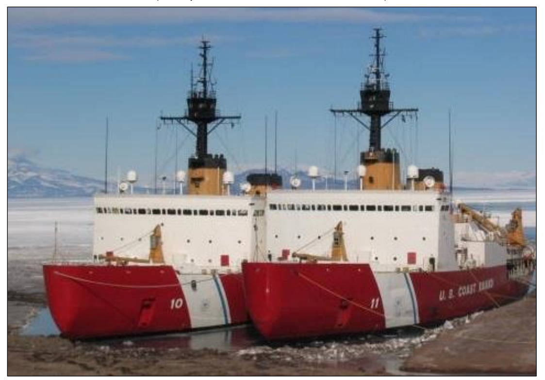
Figure A-I. Polar Star and Polar Sea

(Side by side in McMurdo Sound, Antarctica)