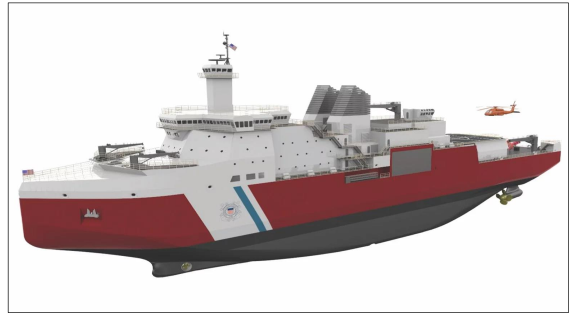
Figure 1. Rendering of VT Halter Design for PSC

design for the new Polar Security Cutter (PSC) 'meets or exceeds all threshold requirements' in the ship specification" for the PSC program.<sup>17</sup>