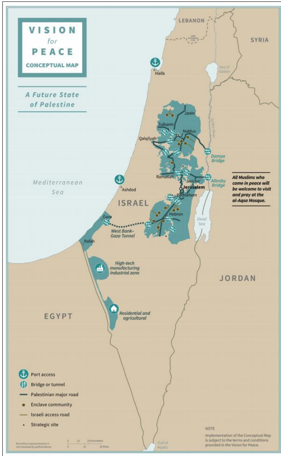
Figure C-2. Conceptual Map of Future Palestinian State