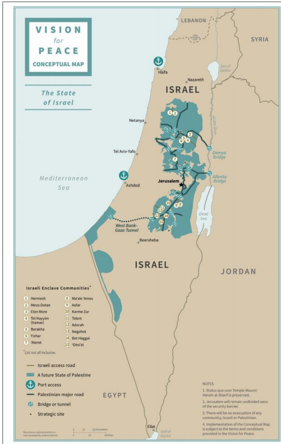
Figure C-1. Conceptual Map of Israel