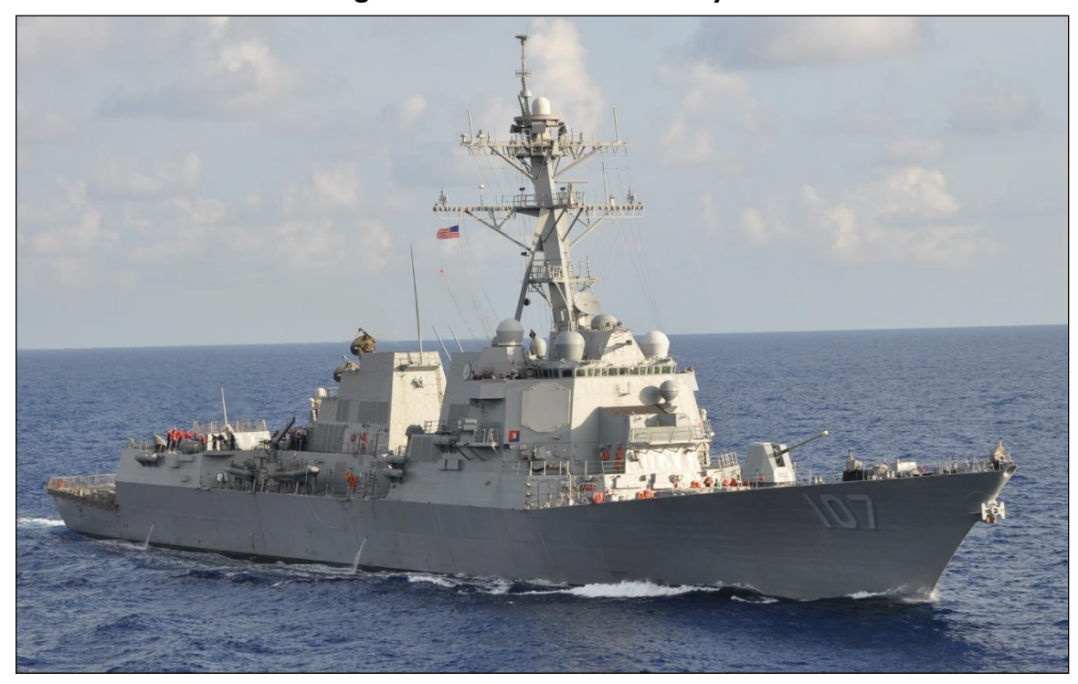
Figure 1. DDG-51 Class Destroyer

The DDG-51 ( Figure 1 ) is a multi-mission destroyer with an emphasis on air defense (which the Navy refers to as anti-air warfare, or AAW) and blue-water (mid-ocean) operations.