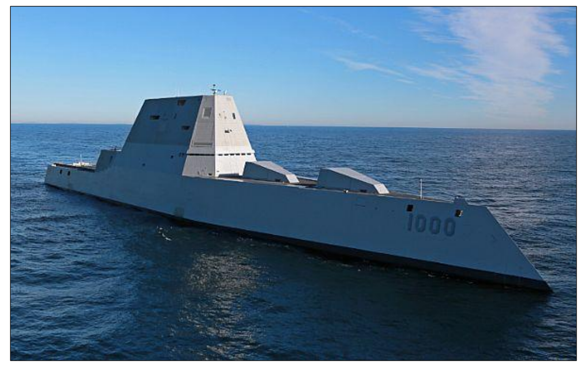
Figure A-1. DDG-1000 Class Destroyer

The DDG-1000 program was initiated in the early 1990s.<sup>21</sup> The DDG-1000 ( Figure A-1 ) is a multi-mission destroyer with an originally intended emphasis on naval surface fire support (NSFS) and operations in littoral (i.e., near-shore) waters. (NSFS is the use of naval guns to provide fire support for friendly forces operating ashore.)