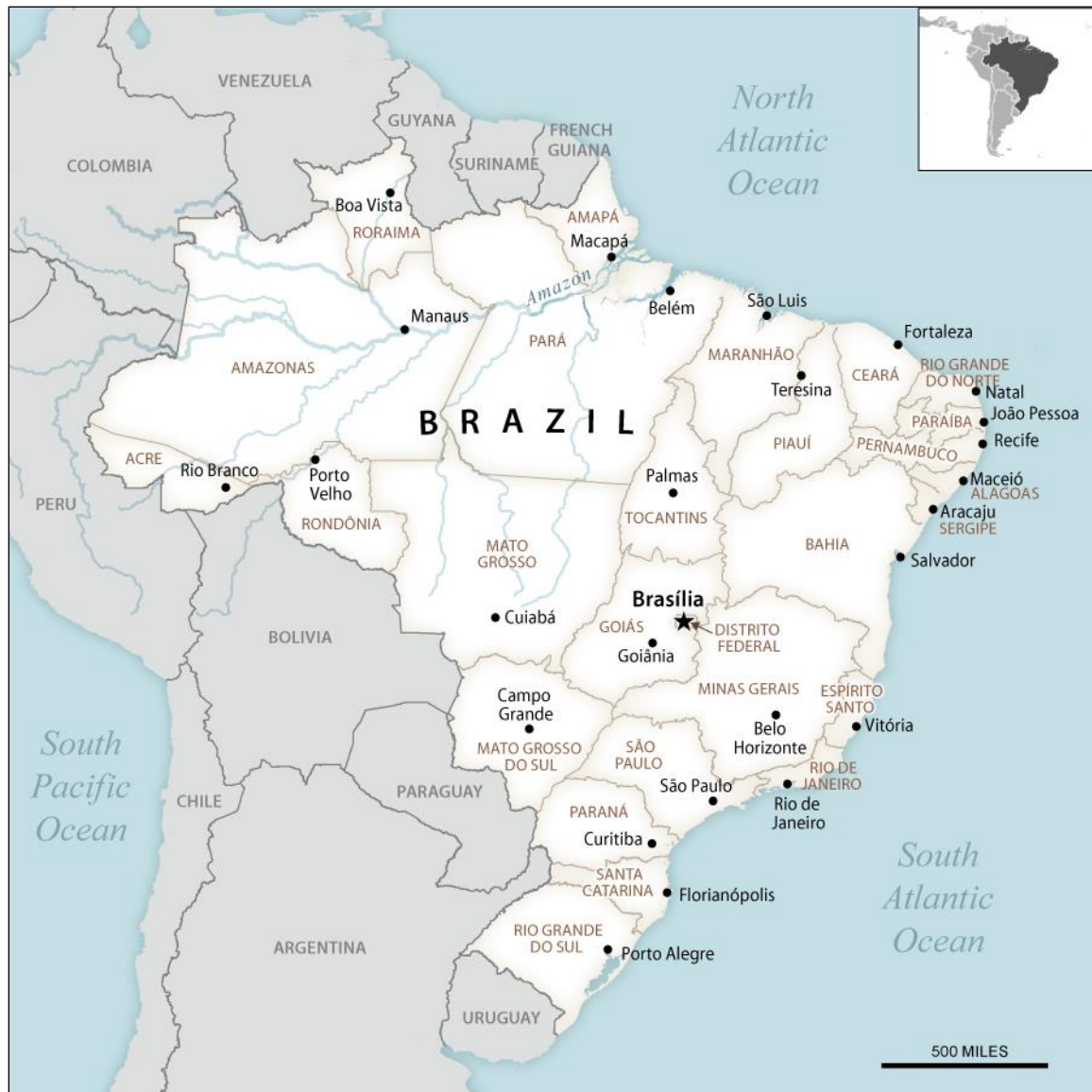
Figure 1. Map of Brazil