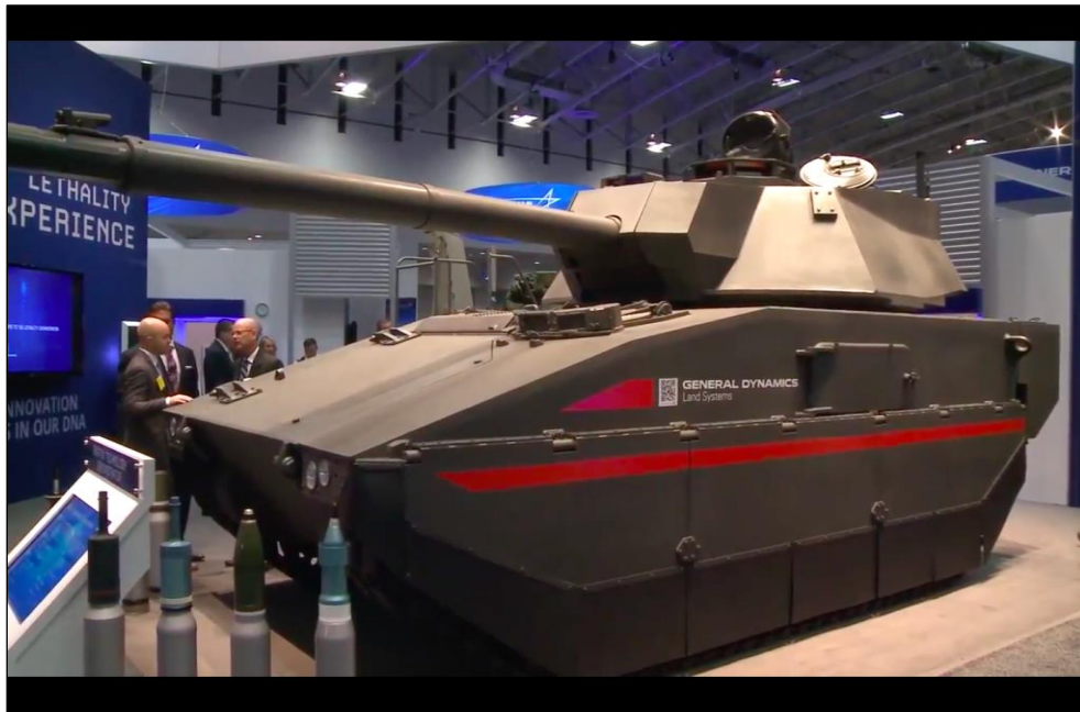
Figure 3. GDLS Griffin III Prototype