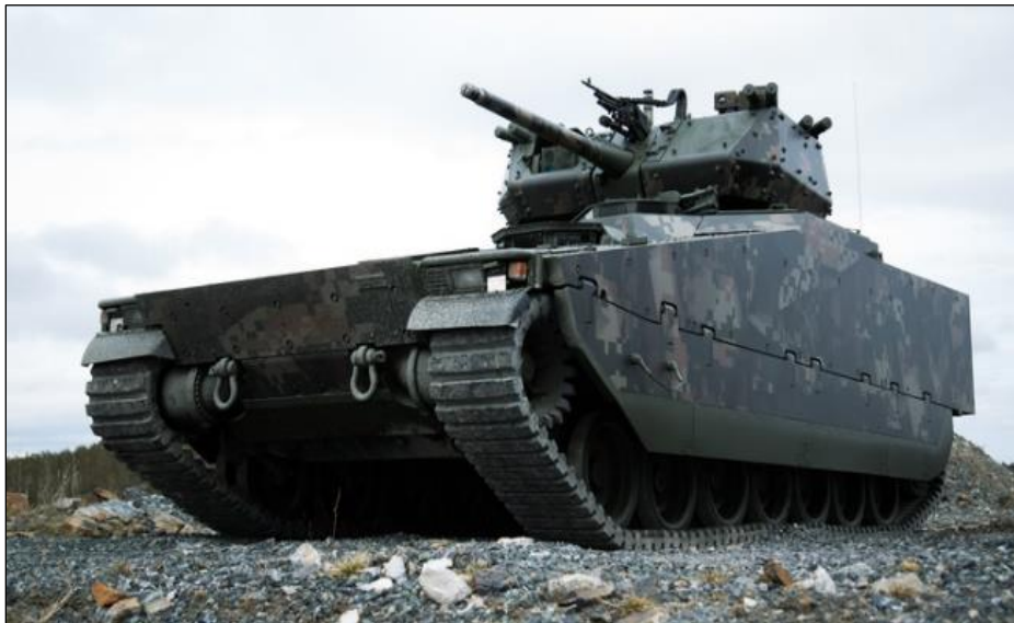
Figure 2. BAE Prototype CV-90