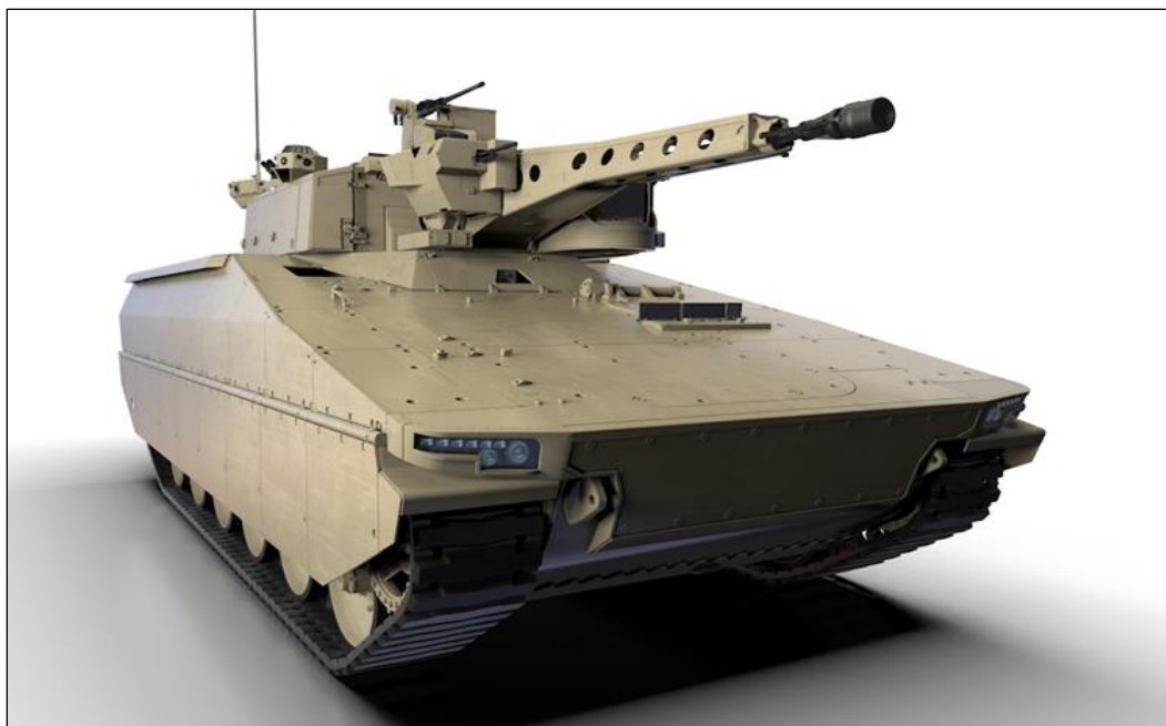
Figure 4. Raytheon/Rheinmetall Lynx Prototype

Source: https://www.rheinmetall-defence.com/en/rheinmetall_defence/systems_and_products/vehicle_systems/armoured_tracked_vehicles/lynx/index.php , accessed January 31, 2019.