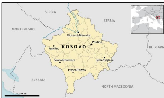
Figure 1. Republic of Kosovo

Analysts generally have been positive in their assessments of Kosovo's democratic development since 2008, particularly its active civil society, pluralistic media sector, and track record of competitive elections. 5 At the same time, many regard corruption and weak rule of law to be serious problems. 6 The so-called Pronto Affair, one of several scandals to emerge in recent years, raised allegations of nepotism on the part of the then-governing PDK. In 2018, 11 PDK officials, including a minister and a lawmaker, were indicted for allegedly offering public jobs to party backers. According to the U.S.-based nongovernmental organization Freedom House, the Pronto case showed "a systemic abuse of power and informal control over state structures." 7 Further, U.S. and EU officials, as well as watchdog groups such as Freedom House, have urged Kosovo to more rigorously enforce anti-corruption rules and uphold judicial independence. 8