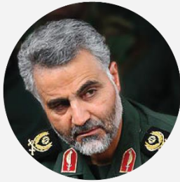
IRGC Major General Qasem Soleimani