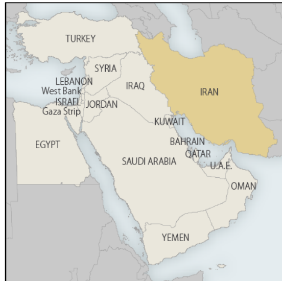
Figure 2. Map of Near East

Several of the GCC states, particularly Saudi Arabia, the UAE, and Bahrain, have been consistently critical of Iran for attempting to destabilize the region and fomenting unrest among Shia communities in the GCC states. Yet, all the GCC states maintain relatively normal trading relations with Iran and, in a possible effort to ease heightened U.S.-Iran and Gulf-Iran tensions in mid-2019, the UAE and Saudi Arabia have conducted direct or sought indirect contact with Iran aimed at de-escalation. The long-standing assertions by Qatar, Kuwait, and Oman that the GCC states should engage Iran consistently contributed to a rift within the GCC in which Saudi Arabia, UAE, and Bahrain—joined by a few other Muslim countries—announced on June 5, 2017, an air,