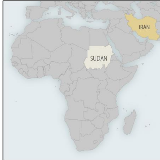
Figure 6. Sudan

The IRGC-QF has reportedly operated in some countries in Africa, in part to secure arms-supply routes for pro-Iranian movements in the Middle East but also to be positioned to act against U.S. or allied interests and to support friendly governments or factions. Several African countries have claimed to disrupt purportedly IRGC-QF-backed arms trafficking or terrorism plots. In May 2013, a court in Kenya found two Iranian men guilty of planning to carry out bombings in Kenya, apparently against Israeli targets. In December 2016, two Iranians and a Kenyan who worked for Iran's embassy in Nairobi were charged with collecting information for a terrorist act after filming the Israeli embassy in that city. Senegal cut diplomatic ties with Iran between 2011 and 2013 after claiming that Iran had trafficked weapons to its domestic separatist insurgency.