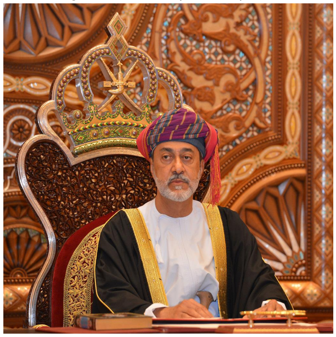
Figure 2. The new Sultan Haythim bin Tariq Al Said