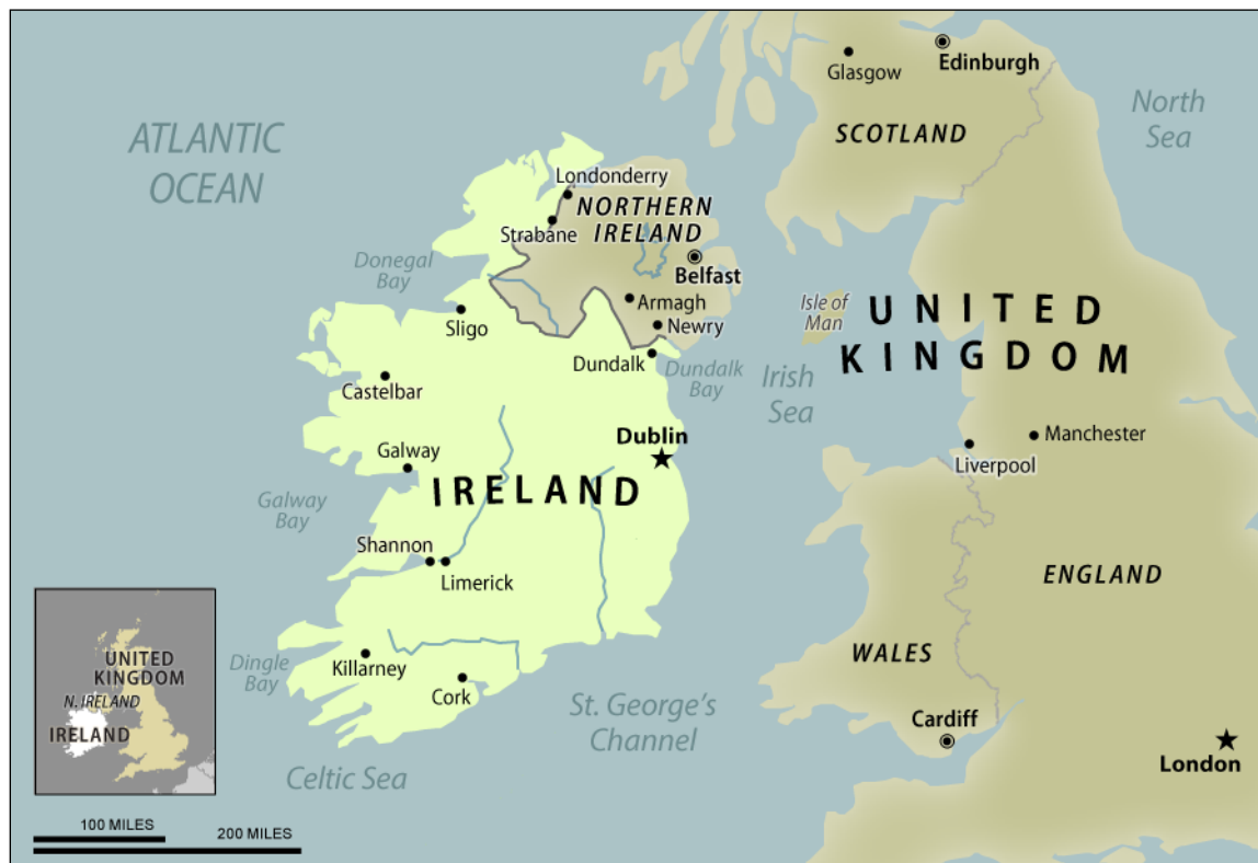
Figure 2. Map of Northern Ireland (UK) and the Republic of Ireland