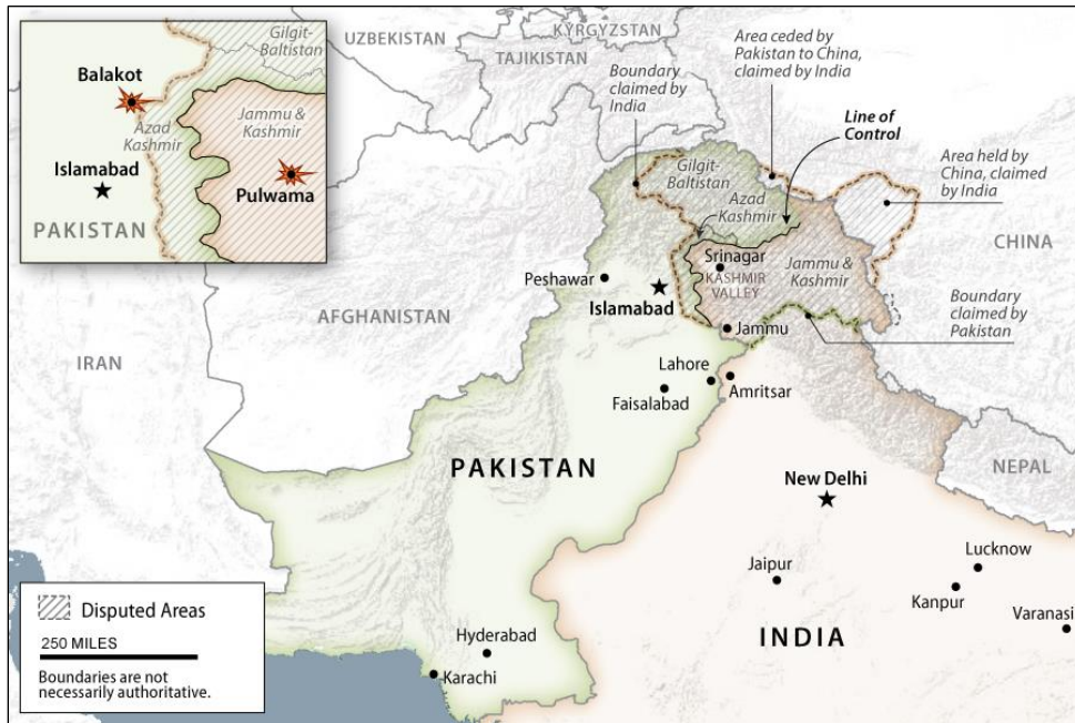
Figure 4. Conflict Map of Pre-August 2019 Jammu & Kashmir

indicated that the incident “only strengthens our resolve” to bolster U.S.-India counterterrorism cooperation. Numerous Members of Congress expressed condemnation and condolences on social media. 49 However, during the crisis, the Trump Administration was seen by some as unhelpfully absent diplomatically, described by one former senior U.S. official as “mostly a bystander” to the most serious South Asia crisis in decades, demonstrating “a lack of focus” and diminished capacity due to vacancies in key State Department positions. 50