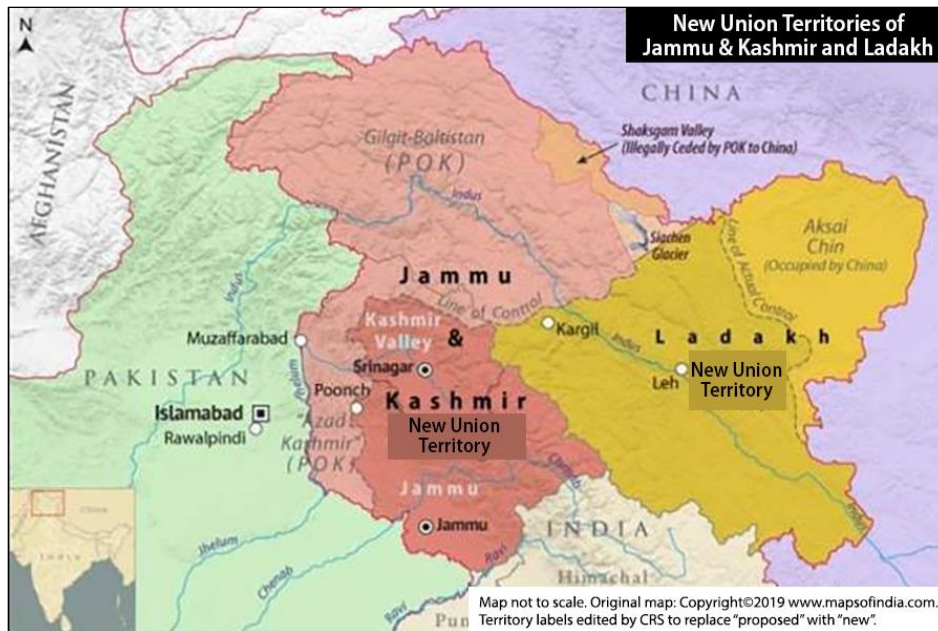
Figure 1. Late 2019 Map of the New J&K and Ladakh Union Territories

India’s former J&K state was about the size of Utah and encompassed three culturally distinct regions: Kashmir, Jammu, and Ladakh (see Figure 1 ). More than half of the mostly mountainous area’s nearly 13 million residents live in the fertile Kashmir Valley, a region slightly larger than Connecticut (7% of the former state’s land area was home to 55% of its population). Srinagar, in the Valley, was the state’s (and current UT’s) summer capital and by far its largest city with some 1.3 million residents. Jammu city, the winter capital, has roughly half that population, and the Jammu district is home to more than 40% of the former state’s residents. About a quarter-million people live in remote Ladakh, abutting China. Just under 1% of India’s total population lives in the former state of J&K.