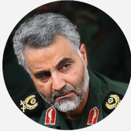
IRGC Major General Qasem Soleimani