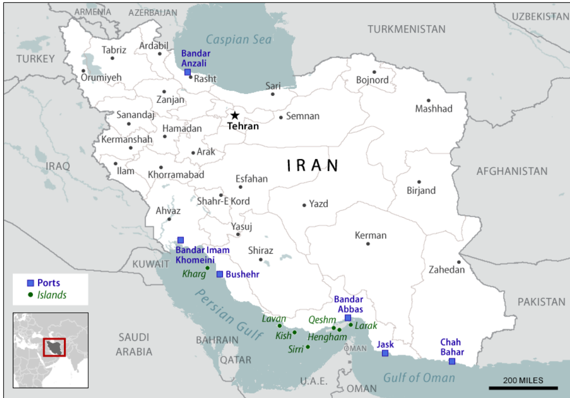
Figure 2. Iran, the Persian Gulf, and the Region