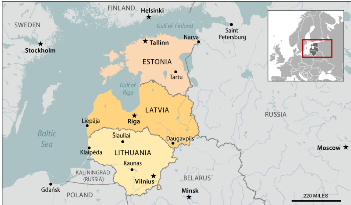
Figure 1. Map of the Baltic Region