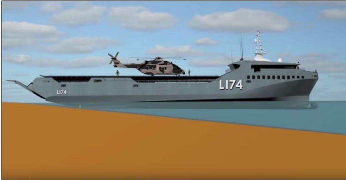
Figure 1. Notional Design for a LAW-Like Ship Artist's rendering

Source: Illustration accompanying Megan Eckstein, “Navy Researching New Class of Medium Amphibious Ship, New Logistics Ships,” USNI News , February 20, 2020. The article credits the image to Sea Transport Solutions, a naval architecture, consulting, surveying, and project-management firm.