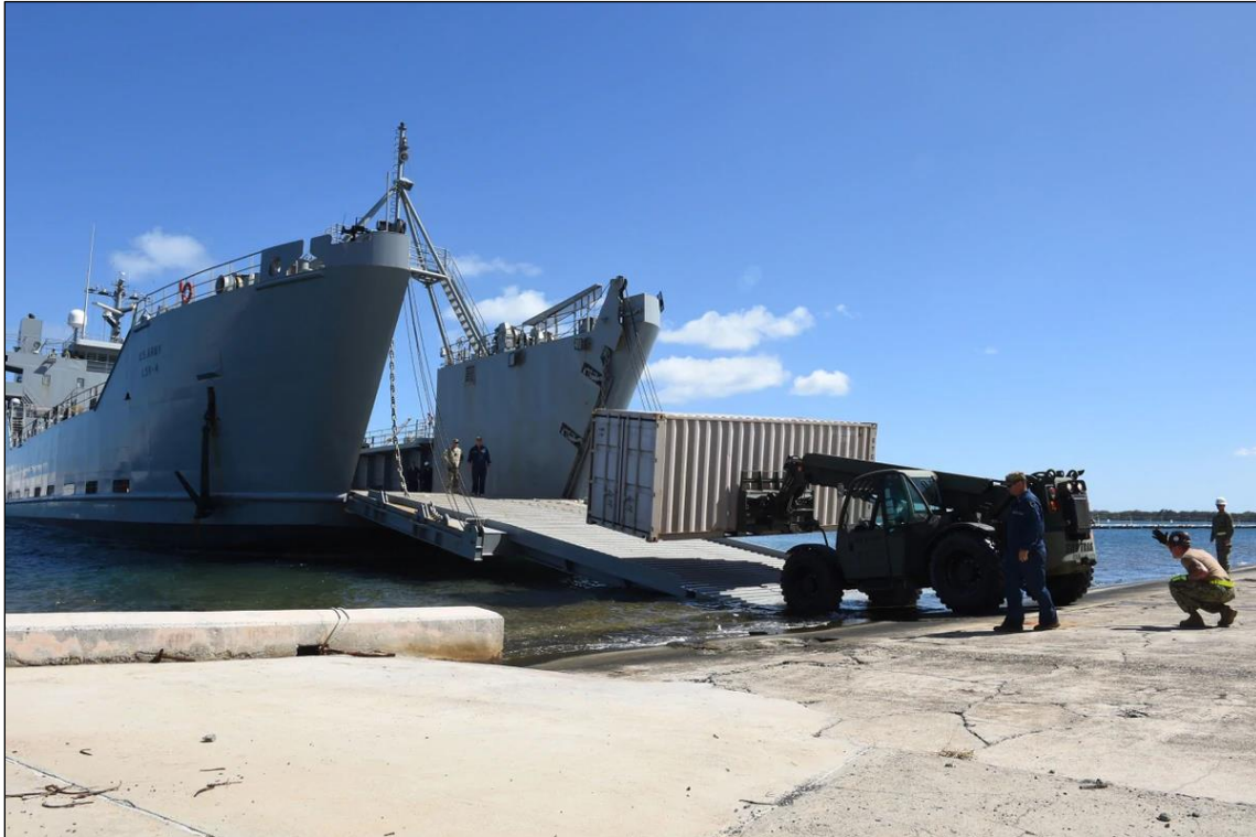
Figure 5. Besson-Class Logistics Support Vessel (LSV)

Source: Photograph accompanying Walker D. Mills and Joseph Hanacek, “The US Navy and Marine Corps Should Acquire Army Watercraft,” Defense News , June 22, 2020. The caption to the photograph credits the photograph to the U.S. Navy and states, “U.S. Navy sailors conduct a simulated disaster relief supply offload from a General Frank S. Besson-class logistics support vessel at Joint Base Pearl Harbor-Hickam on July 10, 2016.”