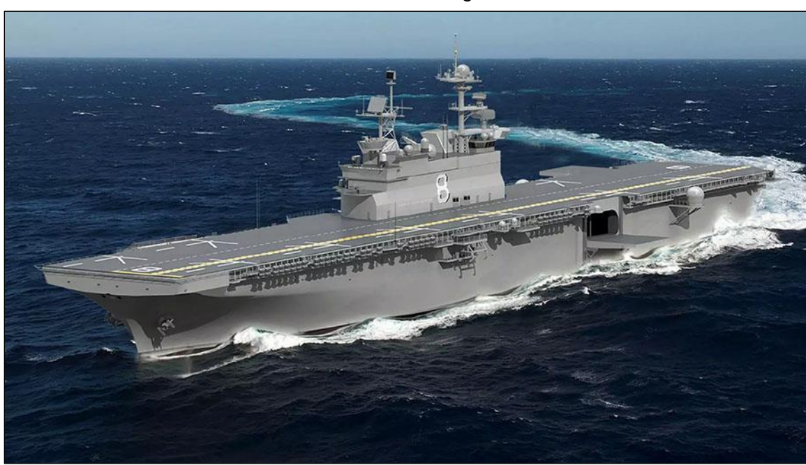
Figure 3. LHA-8 Amphibious Assault Ship