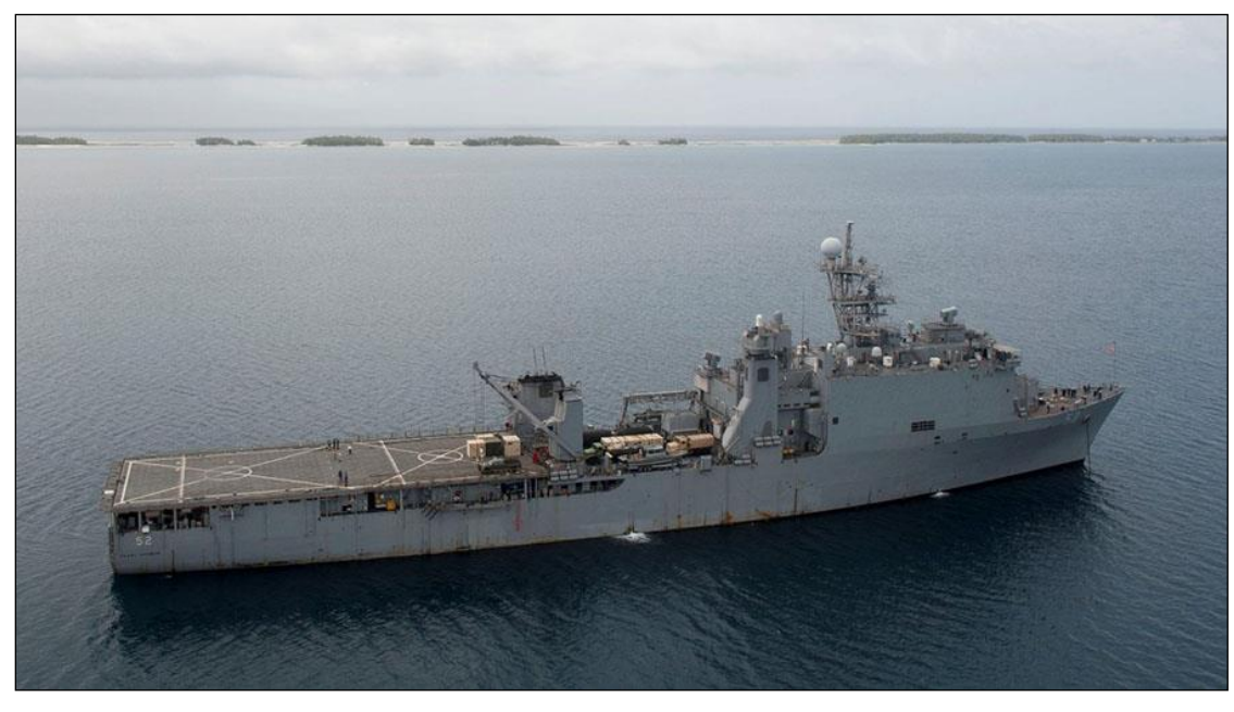
Figure 1. LSD-41/49 Class Ship

numerous U.S. states that provide materials and components for Navy amphibious ships. HII states that the supplier base for its LHA production line, for example, includes 457 companies in 39 states.<sup>20</sup>