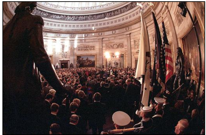
Figure 3. President Ronald Reagan's 1985 Public Inauguration Ceremony