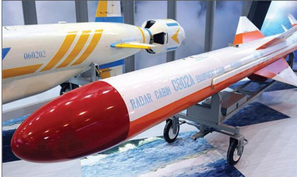
Figure 5. Reported Image of Anti-Ship Cruise Missile (ASCM)