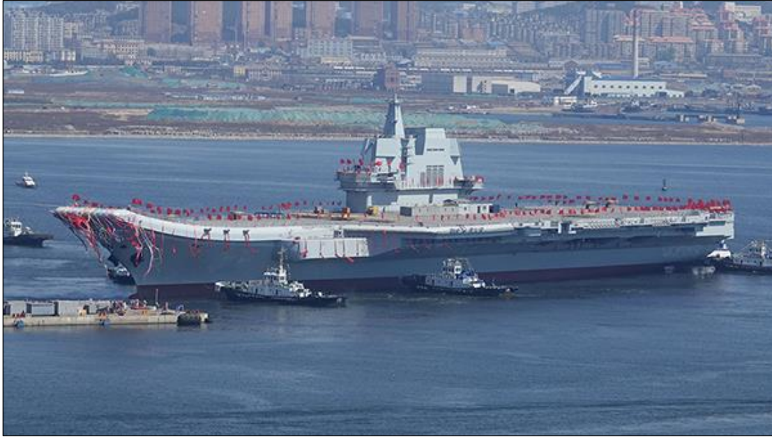
Figure 10. Shandong (Type 002) Aircraft Carrier