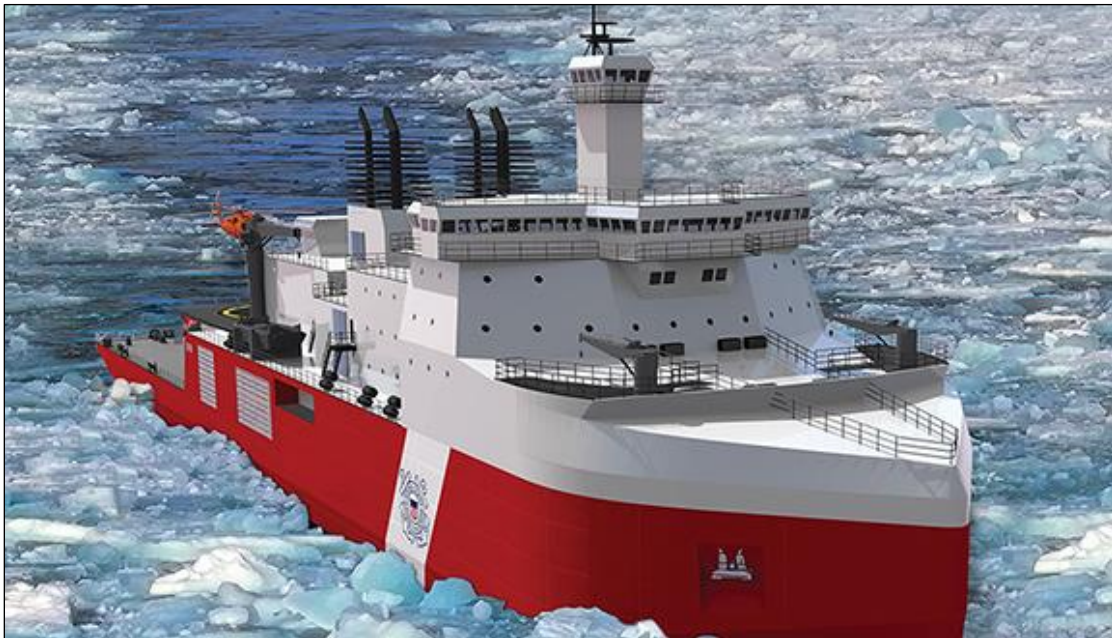
Figure 4. Rendering of VT Halter Design for PSC