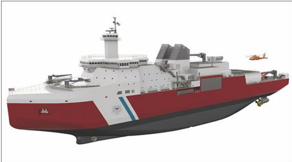
Figure 1. Rendering of VT Halter Design for PSC

Source: Illustration accompanying Sam LaGrone, "UPDATED: VT Halter Marine to Build New Coast Guard Icebreaker," USNI News , April 23, 2019, updated April 24, 2019. The caption to the illustration states "An artist's rendering of VT Halter Marine's winning bid for the U.S. Coast Guard Polar Security Cutter. VT Halter Marine image used with permission."