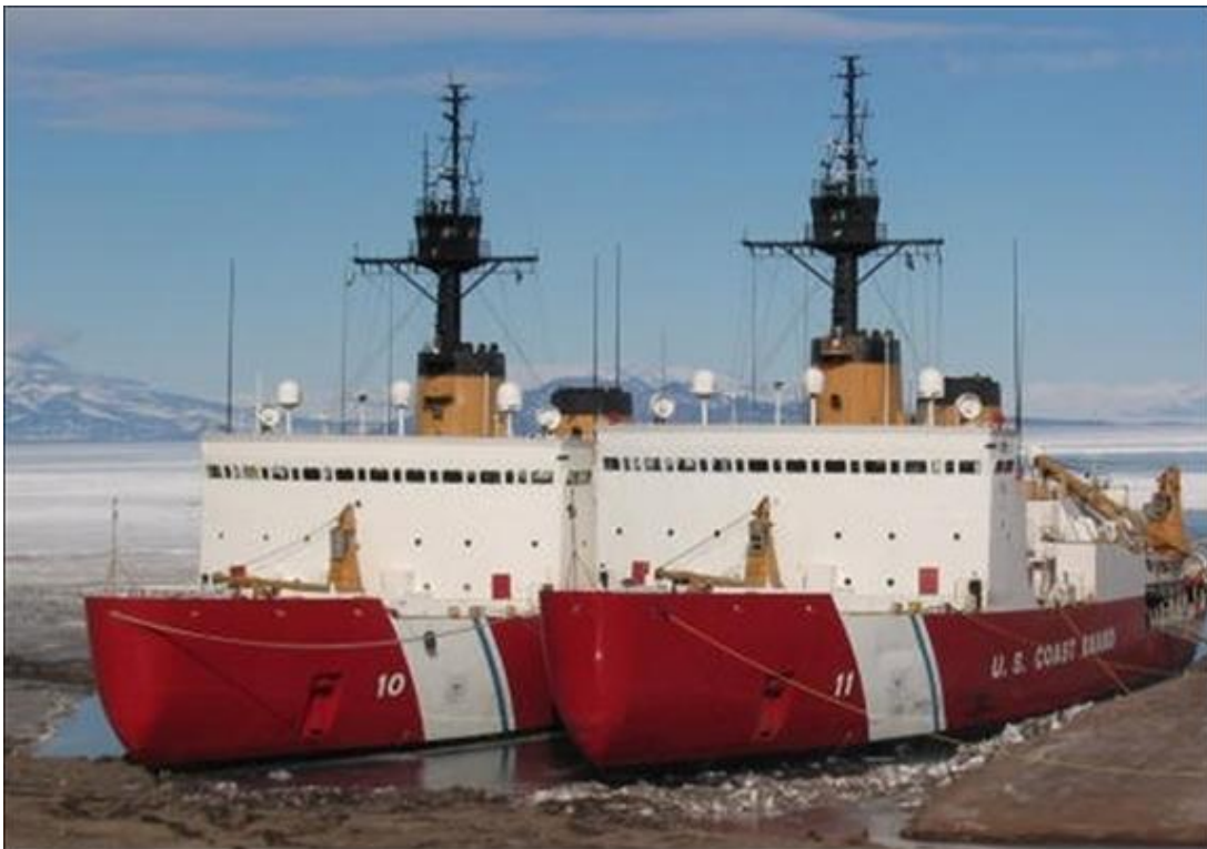
Figure A-1. Polar Star and Polar Sea (Side by side in McMurdo Sound, Antarctica)

Source: Coast Guard photograph that was accessed on April 21, 2011, at http://www.uscg.mil/pacarea/cgcpolarsea/history.asp (link no longer active). The photograph accompanies Kyung M. Song, “Senate Passes Cantwell Measure to Postpone Scrapping of Polar Sea Icebreaker,” Seattle Times , September 22, 2012, posted at http://blogs.seattletimes.com/politicsnorthwest/2012/09/22/senate-passes-cantwell-measure-to-postpone-scrapping-of-polar-sea-icebreaker/ .