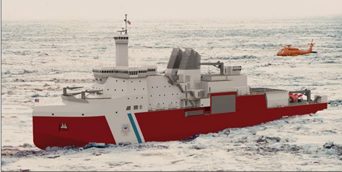
Figure 3. Rendering of VT Halter Design for PSC

Source: Technology Associates, Inc. (cropped version of rendering posted at http://www.navalarchitects.us/pictures.html , accessed June 10, 2020). A similar image was included in VT Halter press release, “VT Halter Marine Awarded the USCG Polar Security Cutter,” May 7, 2019, accessed May 8, 2019, at http://www.vthm.com/public/files/20190507.pdf .