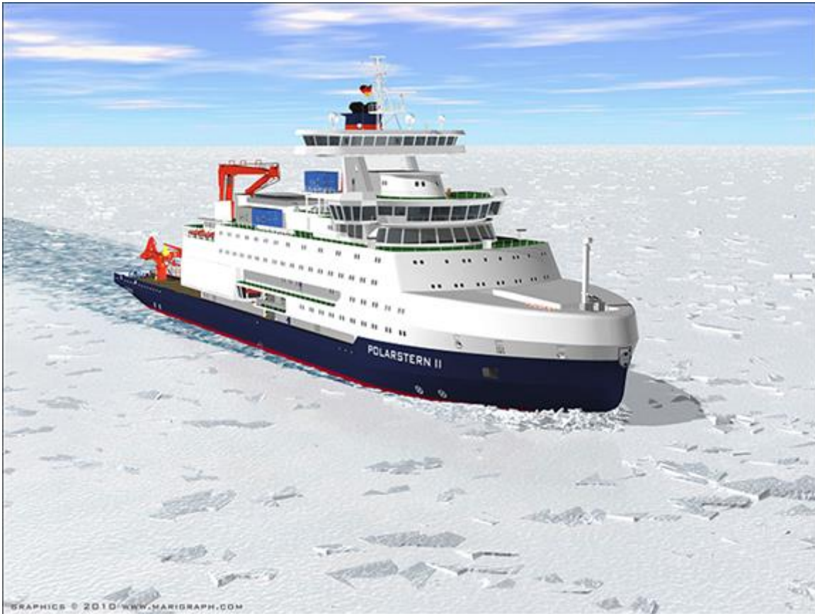
Figure 5. Rendering of SDC Concept Design for Polarstern II