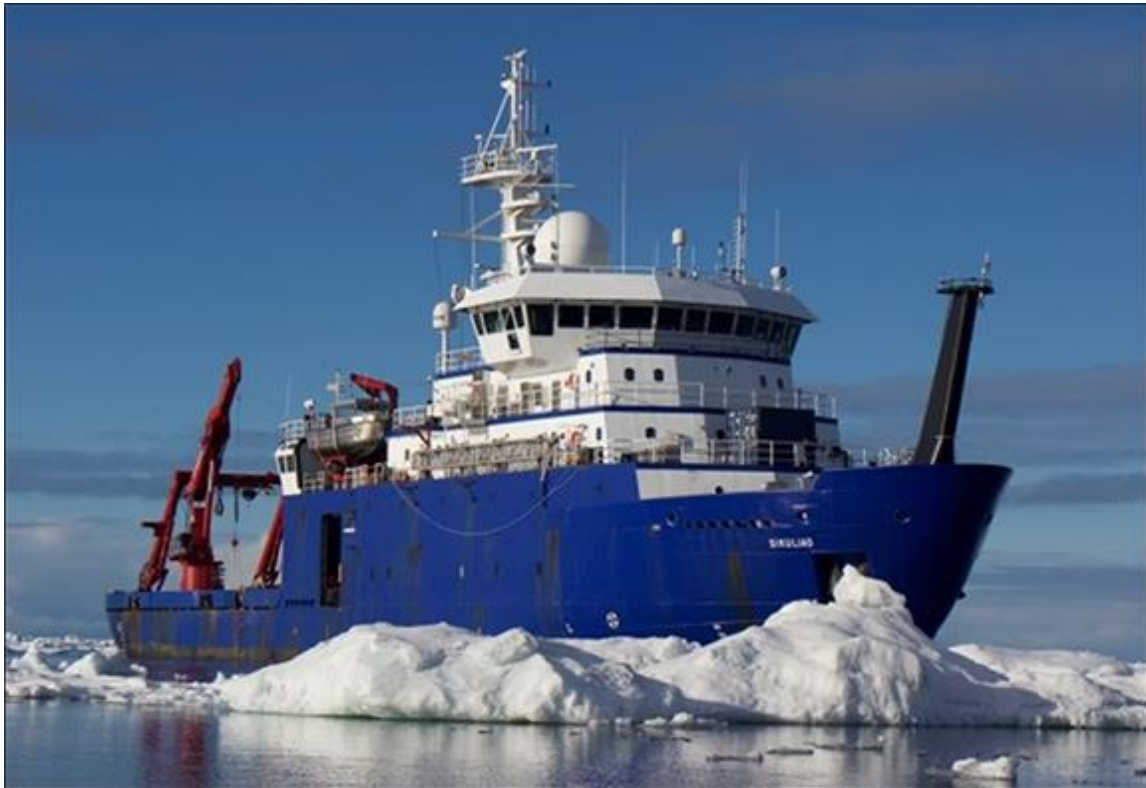
Figure A-6. Sikuliaq