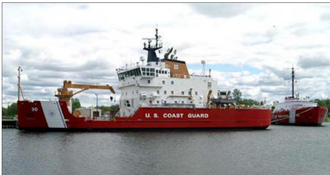
Figure E-1. Great Lakes Icebreaker Mackinaw