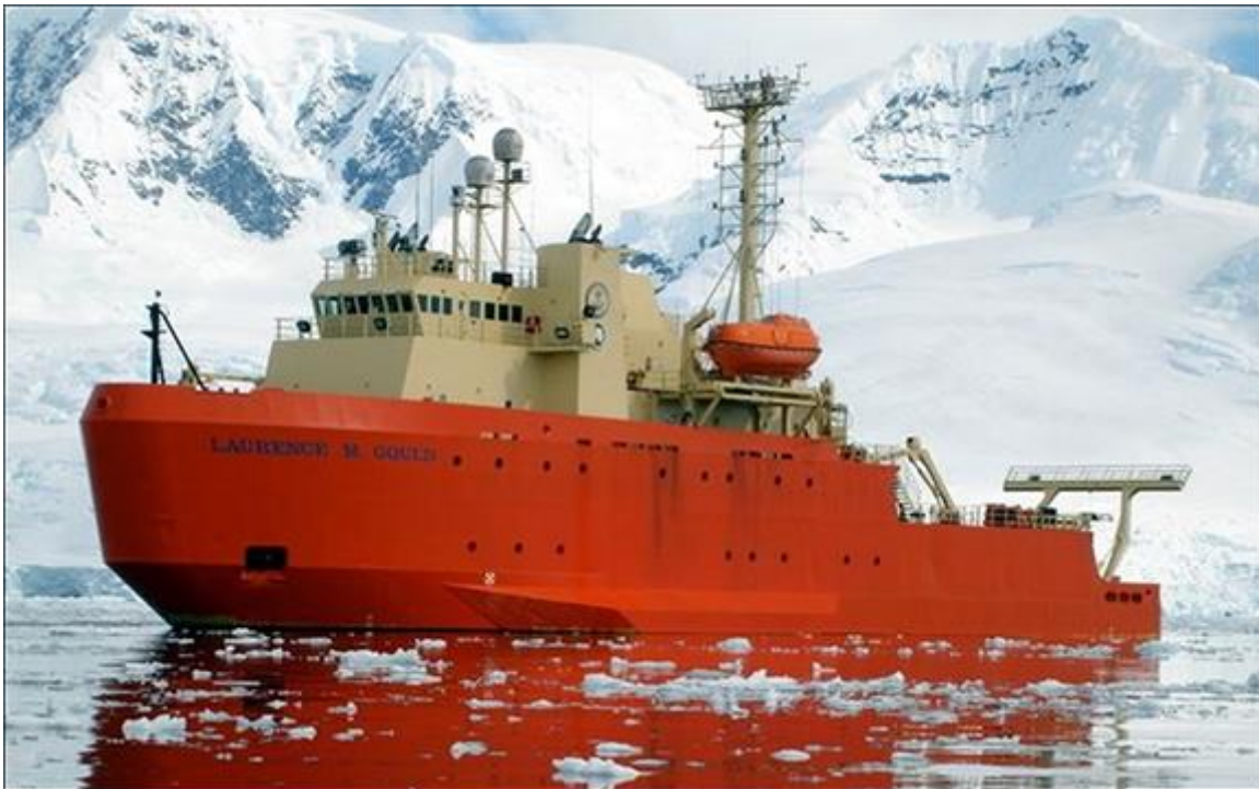
Figure A-5. Laurence M. Gould