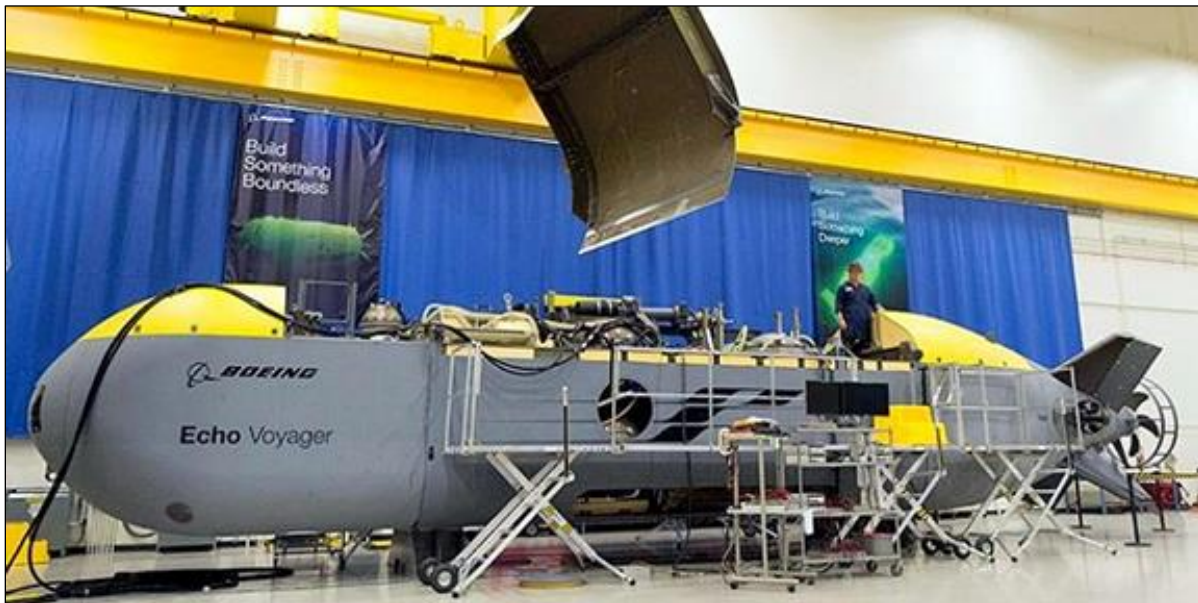
Figure 10. Boeing Echo Voyager UUV