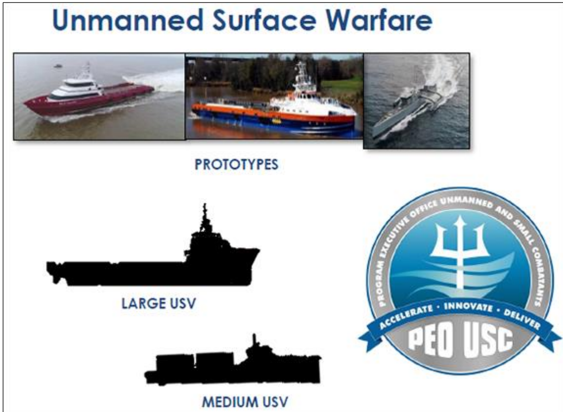
Figure 5. Prototype and Notional LUSVs and MUSVs