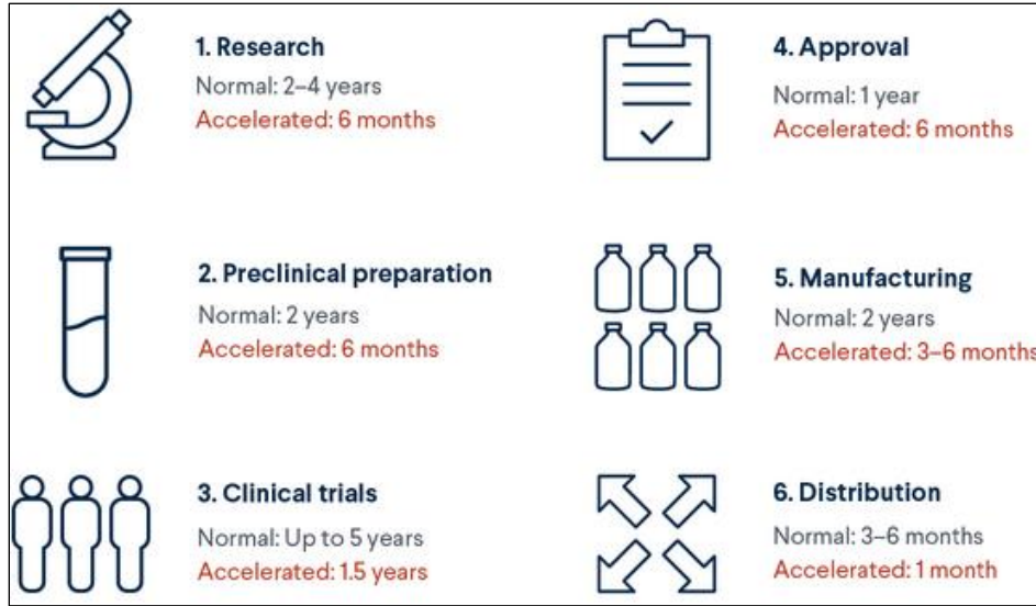
Figure 1. Overview: Normal vs. Accelerated Vaccine Development Process