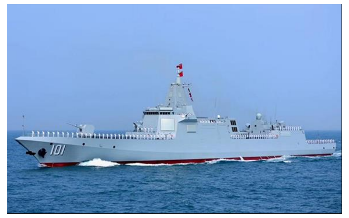
Figure 13. Renhai (Type 055) Cruiser (or Large Destroyer)

and 9,300 tons, respectively, while the U.S. Navy's three Zumwalt (DDG-1000) class destroyers displace about 15,600 tons.