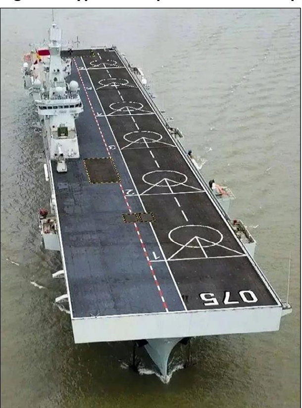
Figure 20. Type 075 Amphibious Assault Ship