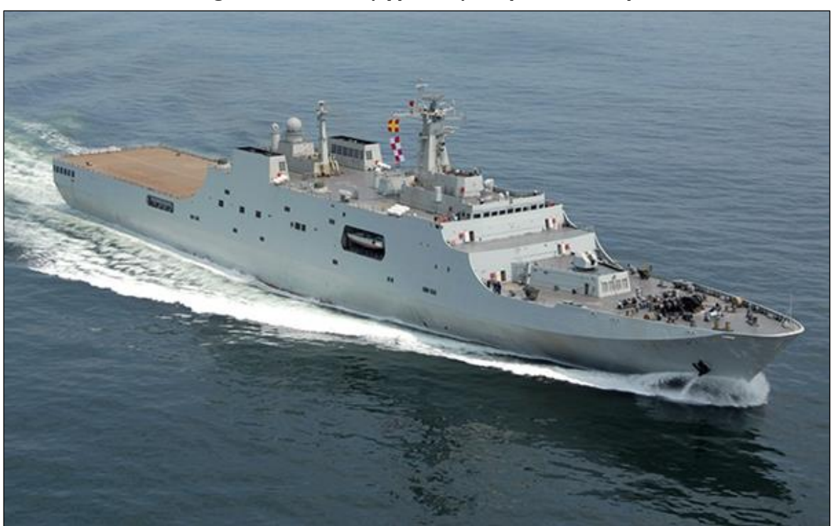
Figure 18. Yuzhao (Type 071) Amphibious Ship