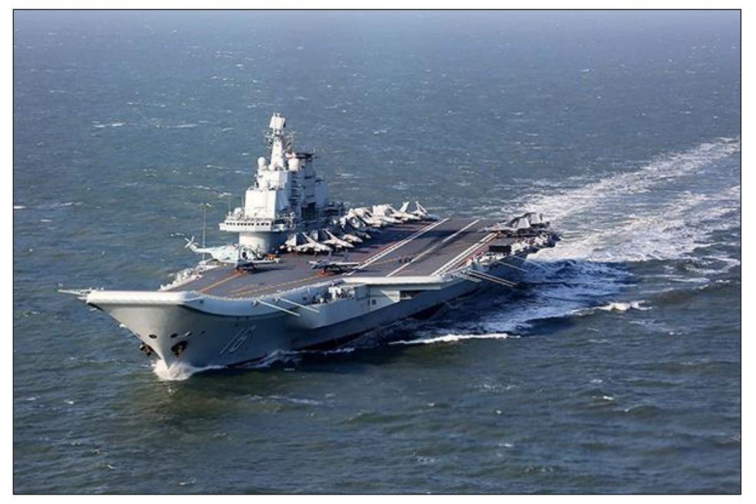
Figure 9. Liaoning (Type 001) Aircraft Carrier

2024.<sup>34</sup> China's fourth carrier, reportedly also to be built to the Type 003 design, reportedly may begin construction as early as 2021.<sup>35</sup>