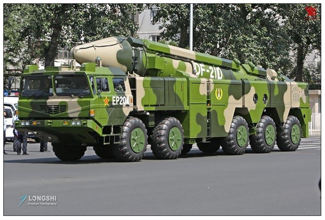
Figure 1. DF-21D Anti-Ship Ballistic Missile (ASBM)

China reportedly is fielding two types of land-based ballistic missiles with a capability of hitting ships at sea—the DF-21D ( Figure 1 ), a road-mobile anti-ship ballistic missile (ASBM) with a range of more than 1,500 kilometers (i.e., more than 910 nautical miles), and the DF-26 ( Figure 2 ), a road-mobile, multi-role intermediate range ballistic missile (IRBM) with a maximum range of about 4,000 kilometers (i.e., about 2,160 nautical miles) that DOD says "is capable of conducting both conventional and nuclear precision strikes against ground targets as well as conventional strikes against naval targets."<sup>21</sup> Until recently, reported test flights of DF-21s and SDF-26s have not involved attempts to hit moving ships at sea. A November 14, 2020, press report, however, stated that an August 2020 test firing of DF-21 and DF-26 ASBMs into the South China resulted in the missiles successfully hitting a moving target ship south of the Paracel Islands.<sup>22</sup> China reportedly is also developing hypersonic glide vehicles that, if incorporated into Chinese ASBMs, could make Chinese ASBMs more difficult to intercept.<sup>23</sup>