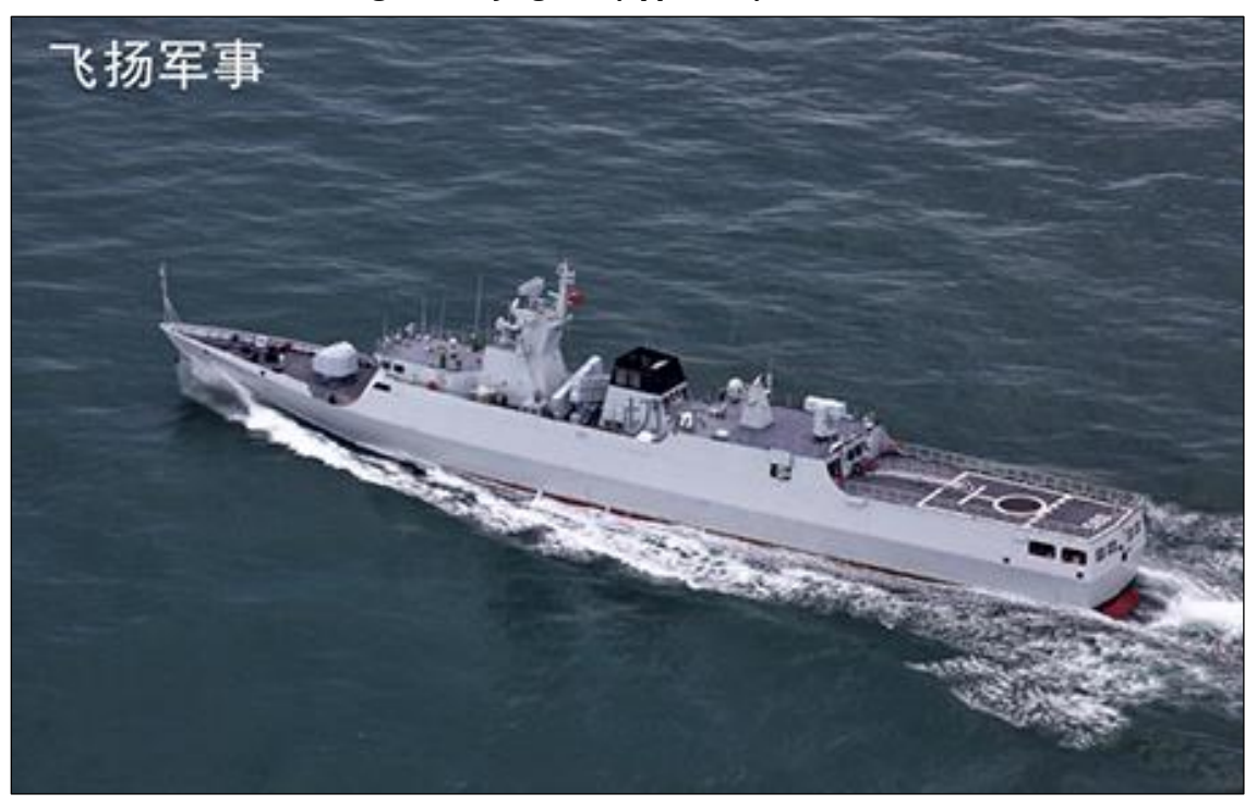
Figure 17. Jingdao (Type 056) Corvette