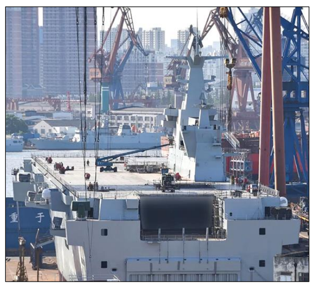
Figure 21. Type 075 Amphibious Assault Ship