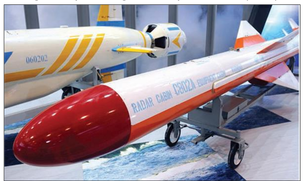
Figure 5. Reported Image of Anti-Ship Cruise Missile (ASCM)