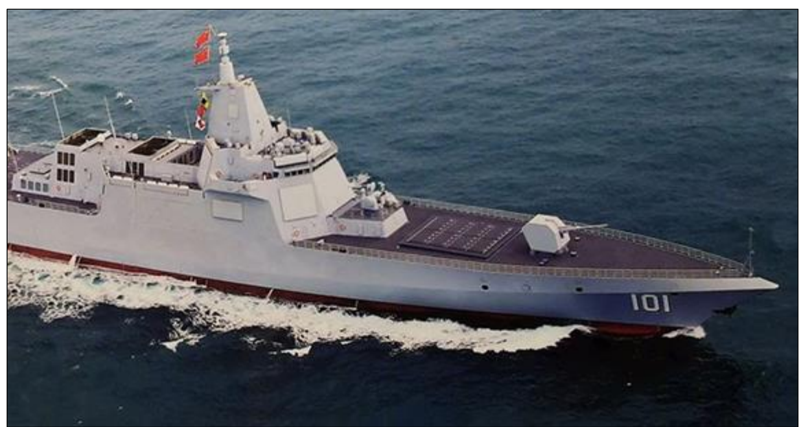
Figure 14. Renhai (Type 055) Cruiser (or Large Destroyer)