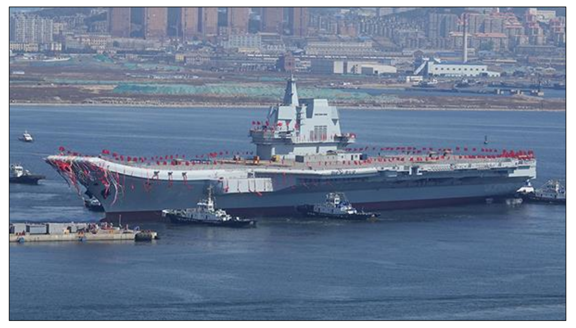
Figure 10. Shandong (Type 002) Aircraft Carrier

technical considerations. Observers expect that it will be some time before China masters carrierbased aircraft operations on a substantial scale.