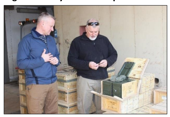
Figure 7. Army Officers Inspect WRSA-I