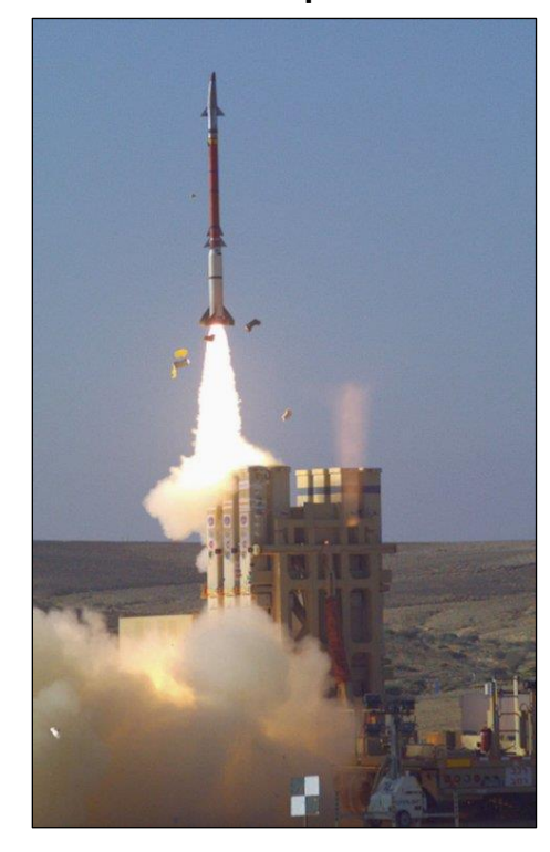
Figure 6. David's Sling Launches Stunner Interceptor

Since FY2006, the United States has contributed over $1.9 billion to the development of David's Sling (see Table 4 ). In June 2018, the United States and Israel signed a co-production agreement for the joint manufacture of the Stunner interceptor.