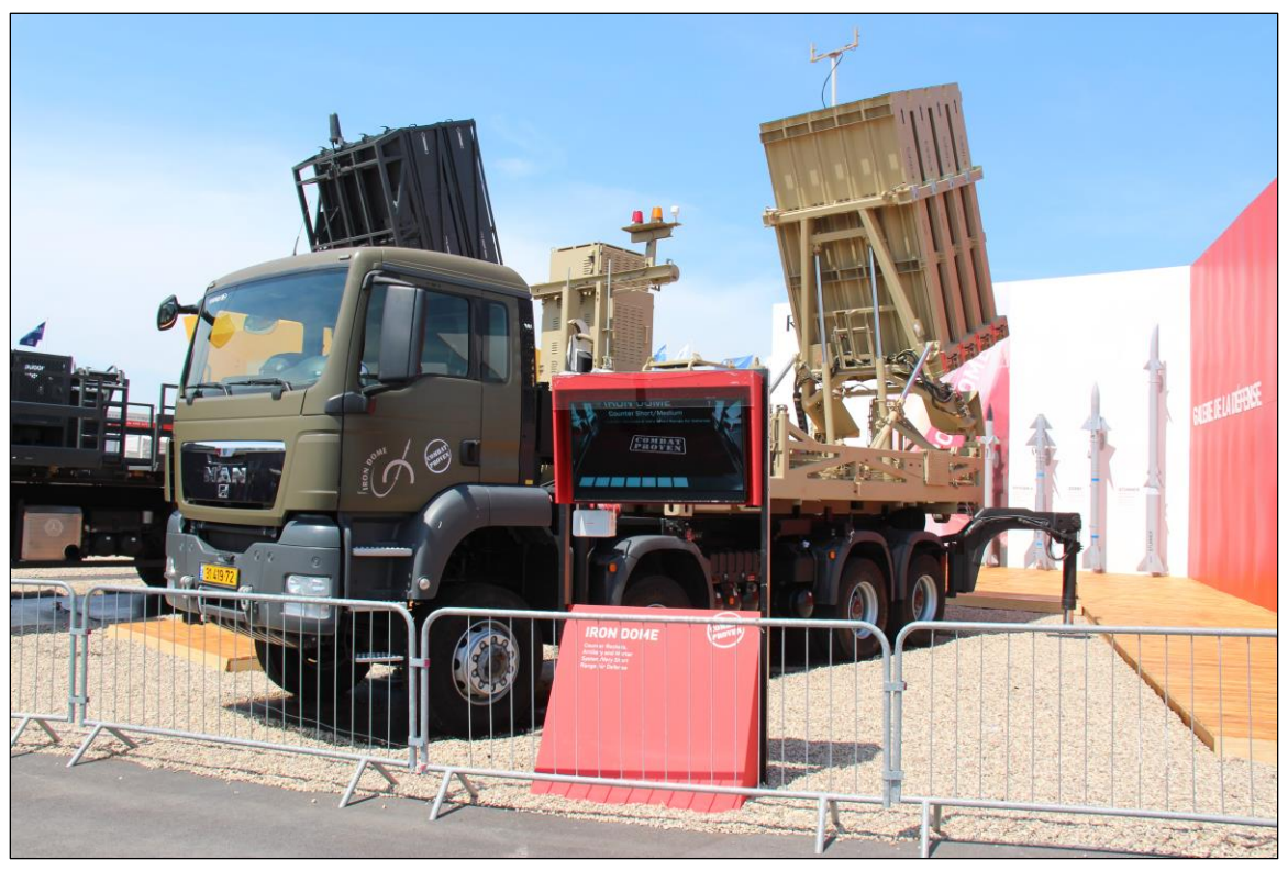
Figure 5. Iron Dome Launcher