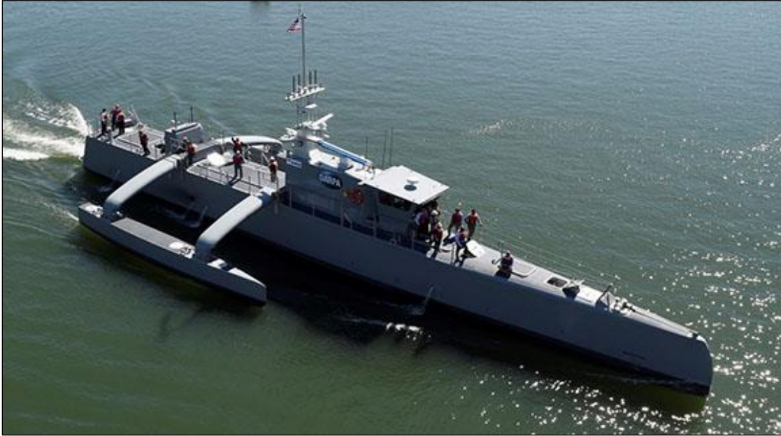
Figure 4. Sea Hunter Prototype Medium Displacement USV