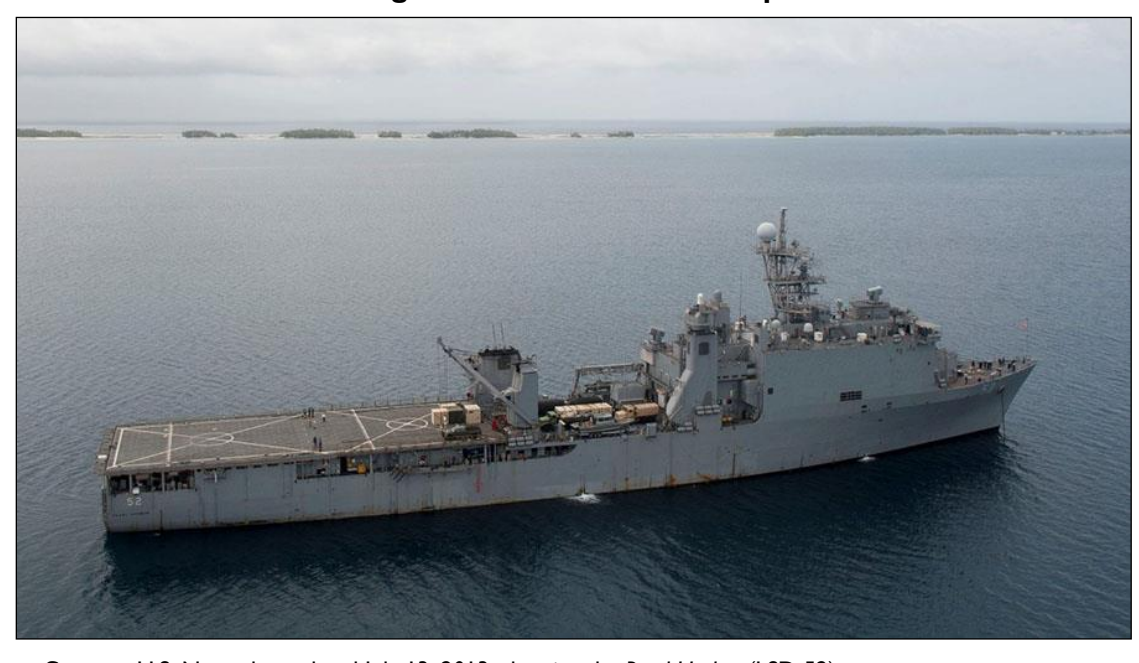
Figure 1. LSD-41/49 Class Ship

numerous U.S. states that provide materials and components for Navy amphibious ships. HII states that the supplier base for its LHA production line, for example, includes 457 companies in 39 states.<sup>20</sup>