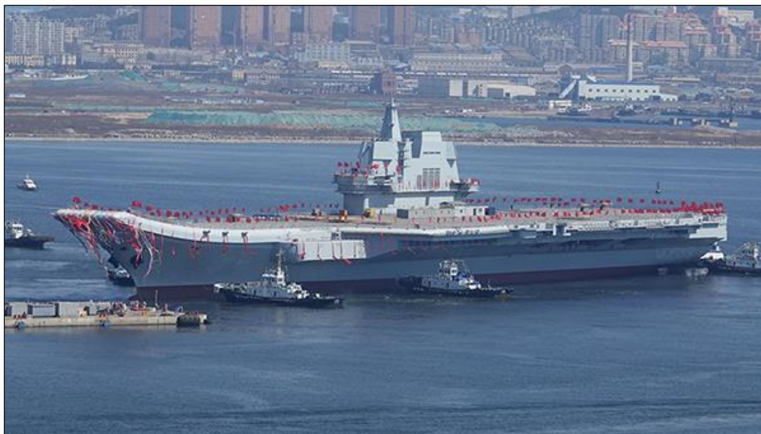
Figure 10. Shandong (Type 002) Aircraft Carrier

Source: Photograph accompanying Daniel Brown, “China’s Newest Aircraft Carrier Is Actually Very Outdated — But Its Next One Should Worry the US Navy A Lot,” Business Insider , July 18, 2018. The article credits the photograph to Reuters.