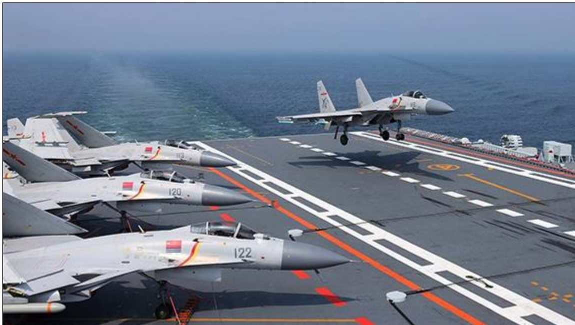
Figure 12. J-15 Flying Shark Carrier-Capable Fighter