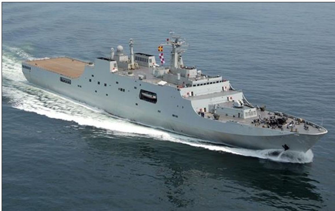
Figure 18. Yuzhao (Type 071) Amphibious Ship