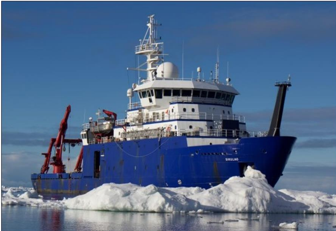
Figure A-6. Sikuliaq