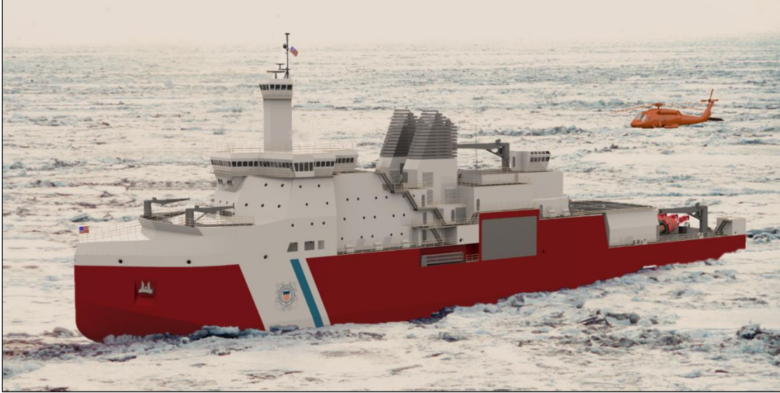
Figure 3. Rendering of VT Halter Design for PSC

Source: Technology Associates, Inc. (cropped version of rendering posted at http://www.navalarchitects.us/pictures.html , accessed June 10, 2020). A similar image was included in VT Halter press release, “VT Halter Marine Awarded the USCG Polar Security Cutter,” May 7, 2019, accessed May 8, 2019, at http://www.vthm.com/public/files/20190507.pdf .