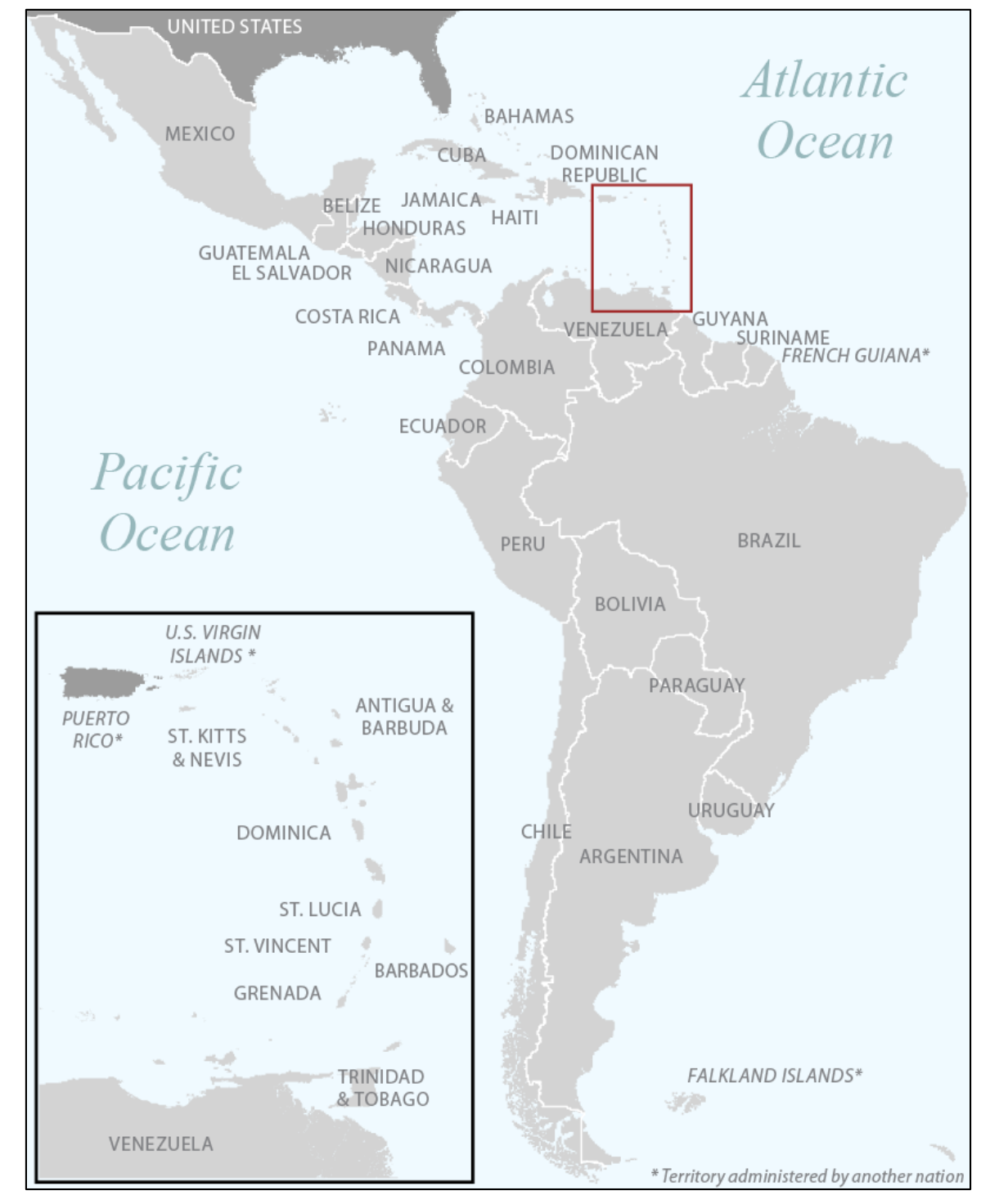
Figure I. Map of Latin America and the Caribbean