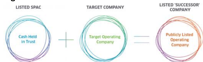
Figure 2. How Does a SPAC Work?

account within 36 months. If the acquisitions cannot be completed within that time, the SPAC must file for an extension or return the funds to investors. At the time of the de-SPAC transaction, the combined company also must meet stock exchange listing requirements for an operating company. The NASDAQ and the New York Stock Exchange are two common exchanges for SPAC listings.