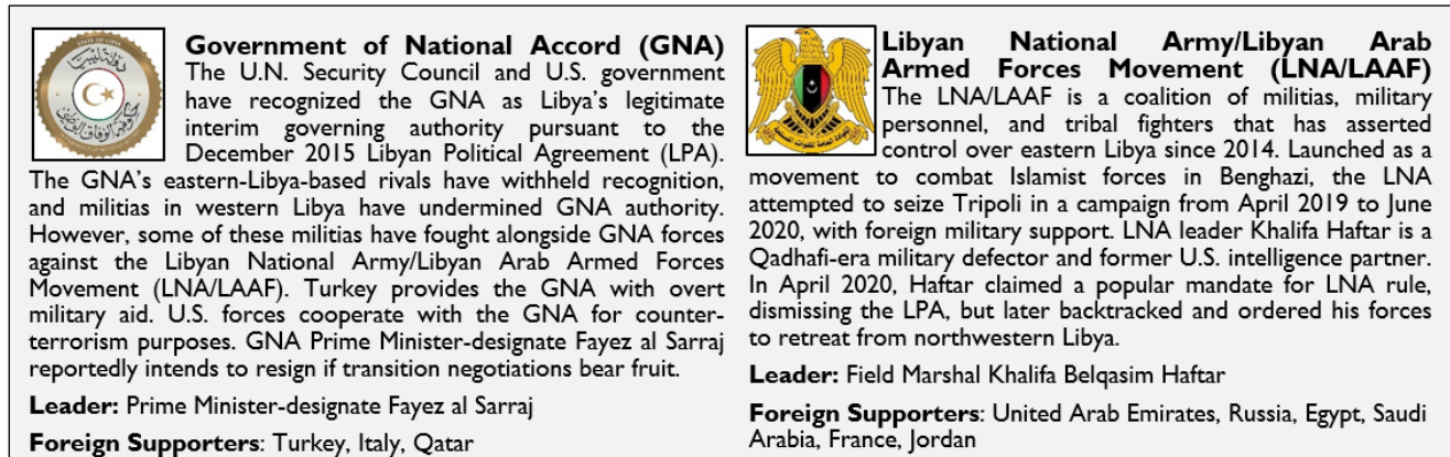
Figure 2. Libya: Principal Coalitions