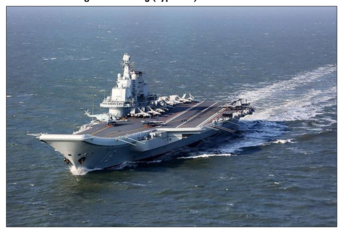
Figure 9. Liaoning (Type 001) Aircraft Carrier

Liaoning is a refurbished ex-Ukrainian aircraft carrier that China purchased from Ukraine in 1998 as an unfinished ship.<sup>34</sup> It is conventionally powered, has an estimated full load displacement of 60,000 to 66,000 tons, and reportedly can accommodate an air wing of 30 or more fixed-wing airplanes and helicopters, including 24 fighters. The Liaoning lacks aircraft catapults and instead launches fixed-wing airplanes off the ship's bow using an inclined "ski ramp."