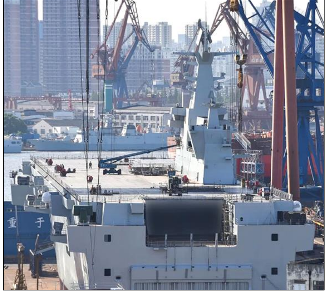
Figure 22. Type 075 Amphibious Assault Ship

Source: Photograph accompanying Joseph Trevithick and Tyler Rogoway, "China Just Launched Its Huge And Incredibly Quickly Built Amphibious Assault Ship," The Drive , September 25, 2019. The caption to the photograph credits the photograph to "Chinese internet."