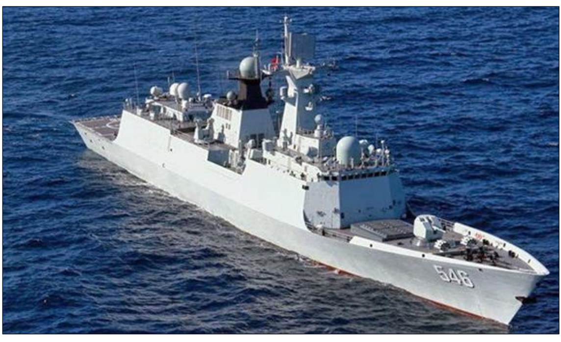
Figure 16. Jiangkai II (Type 054A) Frigate