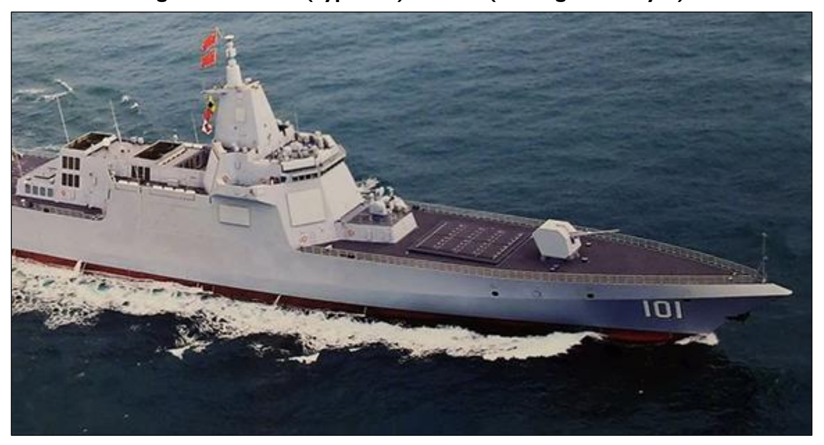
Figure 14. Renhai (Type 055) Cruiser (or Large Destroyer)