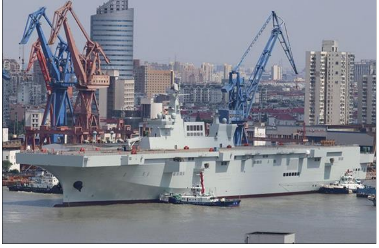
Figure 19. Type 075 Amphibious Assault Ship

On April 22, 2020, China launched the second Type 075 ship.<sup>66</sup> ONI states that as of February 2020, three Type 075s, including the first one, were under construction.<sup>67</sup> An August 7, 2020, press report stated that commercial satellite photographs show the third ship under construction.<sup>68</sup>