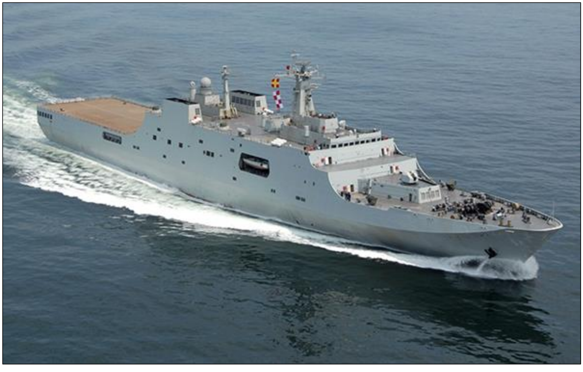
Figure 18. Yuzhao (Type 071) Amphibious Ship