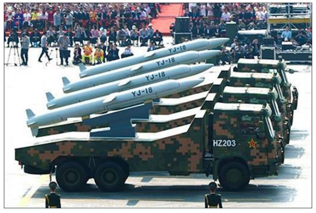
Figure 4. Reported Image of Anti-Ship Cruise Missile (ASCM)

Source: Detail of photograph accompanying Pierre Delrieu, "China Promotes Export of CM-302 Supersonic ASCM," Asian Military Review , July 3, 2017. (The article states "This is an article published in our December 2016 Issue.") The article states "According to Chinese news media reports, the China Aerospace Science and Industry Corporation(CASIC) CM-302 missile is being marketed for export as "the world's best anti-ship missile." The missile was showcased at the Zhuhai air show in the southern People's Republic of China (PRC) in early November [2016], and is advertised as [a] supersonic Anti-Ship Missile (AShM) [ASCM] which can also be used in the land attack role. The report, published by the national newspaper China Daily , suggest[s] that the CM-302 is the export version of CASIC's YJ-12 supersonic AShM, which is in service with the PRC's armed forces.")