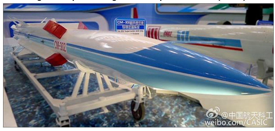
Figure 3. Reported Image of Anti-Ship Cruise Missile (ASCM)

Source: Detail of photograph accompanying Pierre Delrieu, "China Promotes Export of CM-302 Supersonic ASCM," Asian Military Review , July 3, 2017. (The article states "This is an article published in our December 2016 Issue.") The article states "According to Chinese news media reports, the China Aerospace Science and Industry Corporation(CASIC) CM-302 missile is being marketed for export as "the world's best anti-ship missile." The missile was showcased at the Zhuhai air show in the southern People's Republic of China (PRC) in early November [2016], and is advertised as [a] supersonic Anti-Ship Missile (AShM) [ASCM] which can also be used in the land attack role. The report, published by the national newspaper China Daily , suggest[s] that the CM-302 is the export version of CASIC's YJ-12 supersonic AShM, which is in service with the PRC's armed forces.")