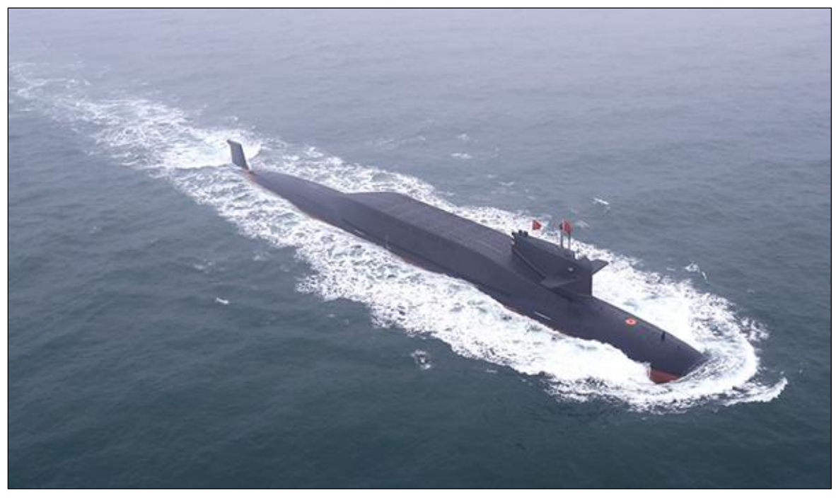
Figure 8. Jin (Type 094) Ballistic Missile Submarine (SSBN)