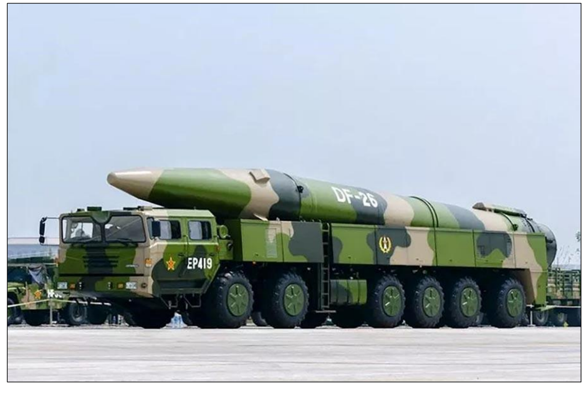
Figure 2. DF-26 Multi-Role Intermediate-Range Ballistic Missile (IRBM)

Western Pacific. The U.S. Navy has not previously faced a threat from highly accurate ballistic missiles capable of hitting moving ships at sea. For this reason, some observers have referred to ASBMs as a "game-changing" weapon.