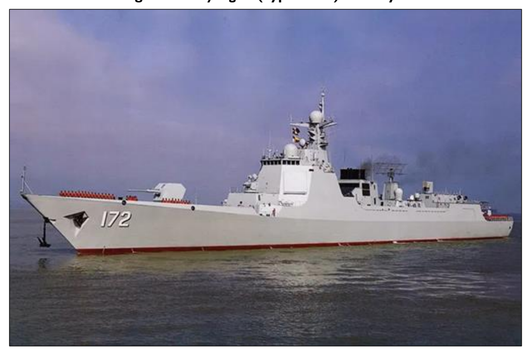
Figure 15. Luyang III (Type 052D) Destroyer

China since the early 1990s has put into service multiple new classes of indigenously built destroyers, the most recent of which is the Luyang III (Type 052D) class ( Figure 15 ), which displaces about 7,500 tons and is equipped with phased-array radars and vertical launch missile systems that outwardly are broadly similar to those on U.S. Navy cruisers and destroyers. Type 052D ships have been in serial production for some time, and the 25<sup>th</sup> such ship was reportedly launched on August 30, 2020.<sup>54</sup> One observer states that "at present the PLAN fields 20 aegistype [i.e., Type 052] destroyers in service; however in four to five years it is likely that the PLAN will field 39 aegis-type destroyers in service (or 40, depending on whether a 26th 052D is built or not)."