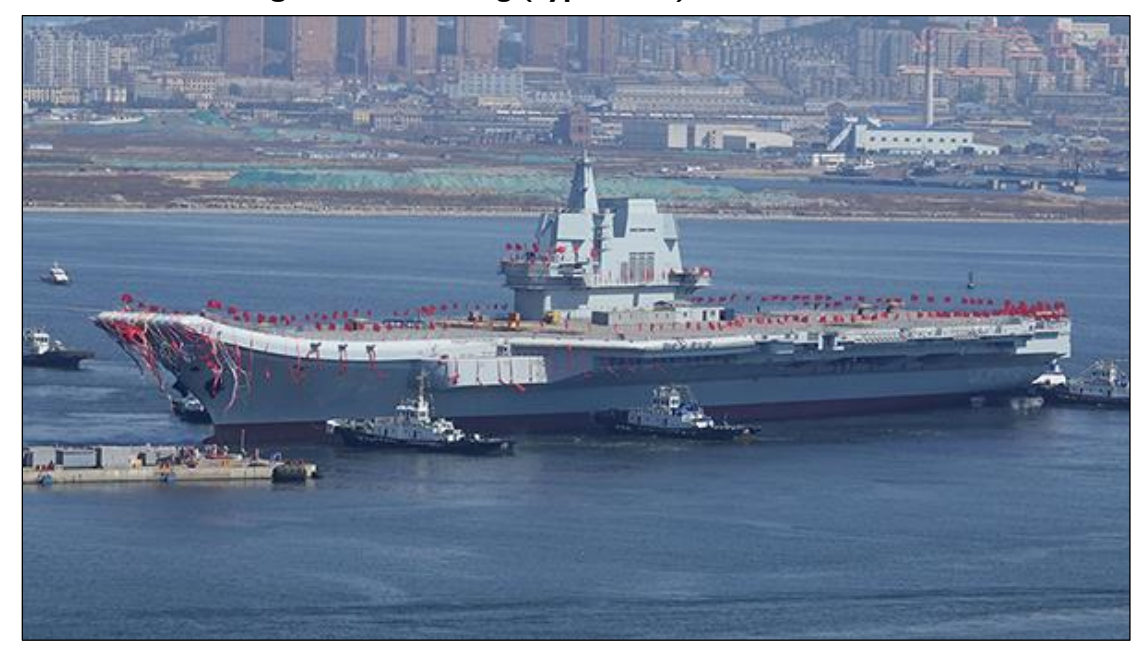
Figure 10. Shandong (Type 001A) Aircraft Carrier

Shandong is a modified version of the Liaoning design that incorporates some design improvements, including features that reportedly will permit it to embark and operate a larger air wing of 40 aircraft that includes 36 fighters.<sup>36</sup> Its displacement is estimated at 66,000 to 70,000 tons.