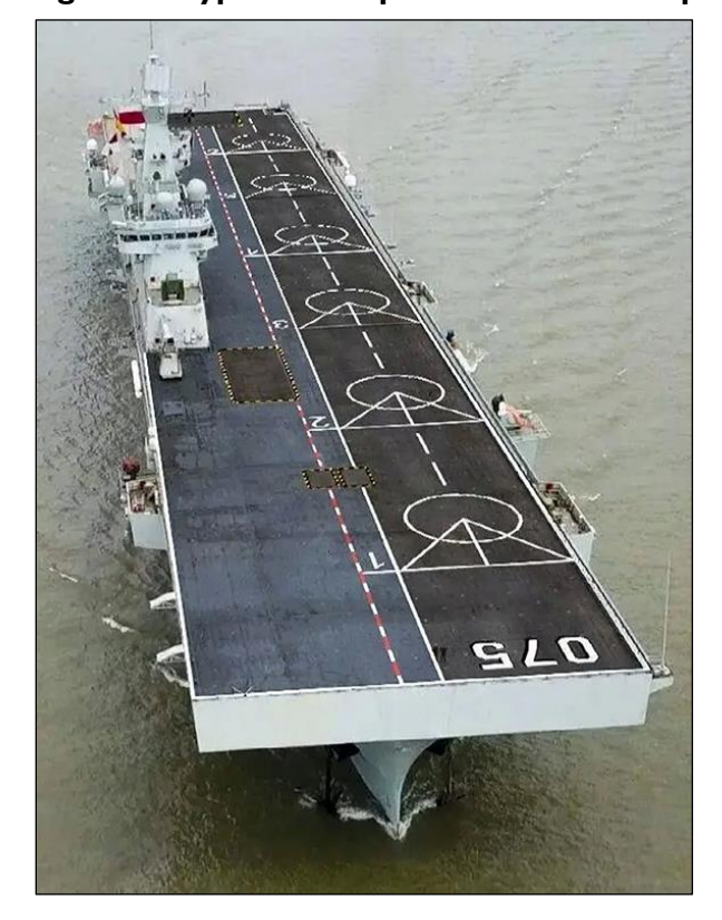
Figure 21. Type 075 Amphibious Assault Ship