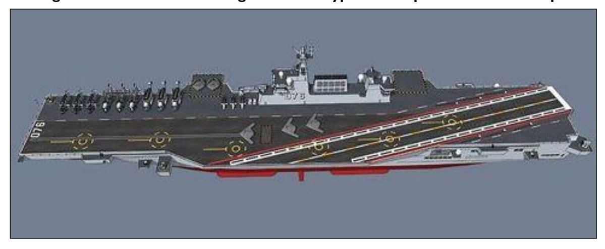
Figure 25. Notional Rendering of Possible Type 076 Amphibious Assault Ship

Source: Illustration accompanying H. I. Sutton, "Stealth UAVs Could Give China's Type-076 Assault Carrier More Firepower," Forbes , July 23, 2020.