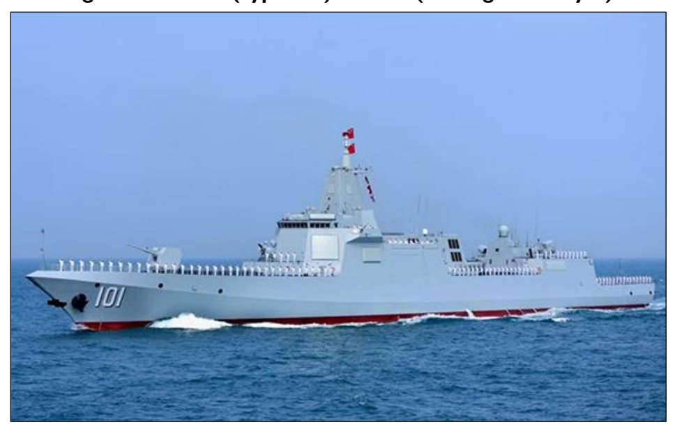
Figure 13. Renhai (Type 055) Cruiser (or Large Destroyer)

China is building a new class of cruiser (or large destroyer), called the Renhai-class or Type 055 ( Figure 13 and Figure 14 ), that reportedly displaces between 10,000 and 13,000 tons. By way of comparison, the U.S. Navy's Ticonderoga (CG-47) class cruisers and Arleigh Burke (DDG-51) class destroyers (aka the U.S. Navy's Aegis cruisers and destroyers) displace about 10,100 tons and 9,300 tons, respectively, while the U.S. Navy's three Zumwalt (DDG-1000) class destroyers displace about 15,600 tons.