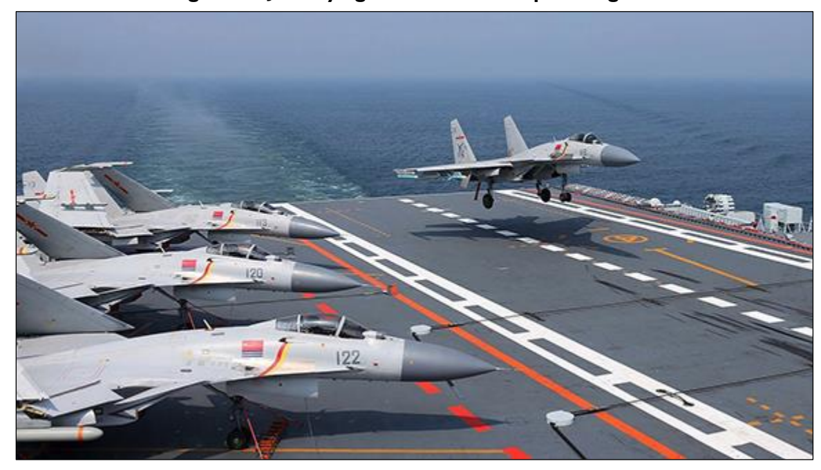
Figure 12. J-15 Flying Shark Carrier-Capable Fighter

Chinese aircraft carriers could also be used for humanitarian assistance and disaster relief (HA/DR) operations, maritime security operations (such as antipiracy operations), and noncombatant evacuation operations (NEOs). Politically, aircraft carriers could be particularly valuable to China for projecting an image of China as a major world power, because aircraft carriers are viewed by many as symbols of major world power status. In a combat situation involving opposing U.S. naval and air forces, Chinese aircraft carriers would be highly vulnerable to attack by U.S. ships and aircraft, but conducting such attacks could divert U.S. ships and aircraft from performing other missions in a conflict situation with China.