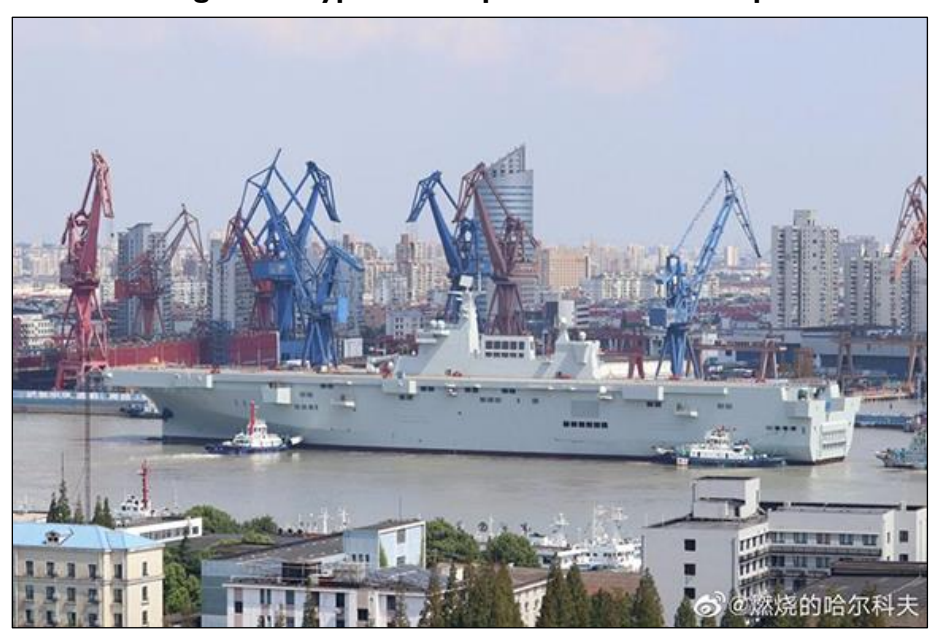
Figure 20. Type 075 Amphibious Assault Ship