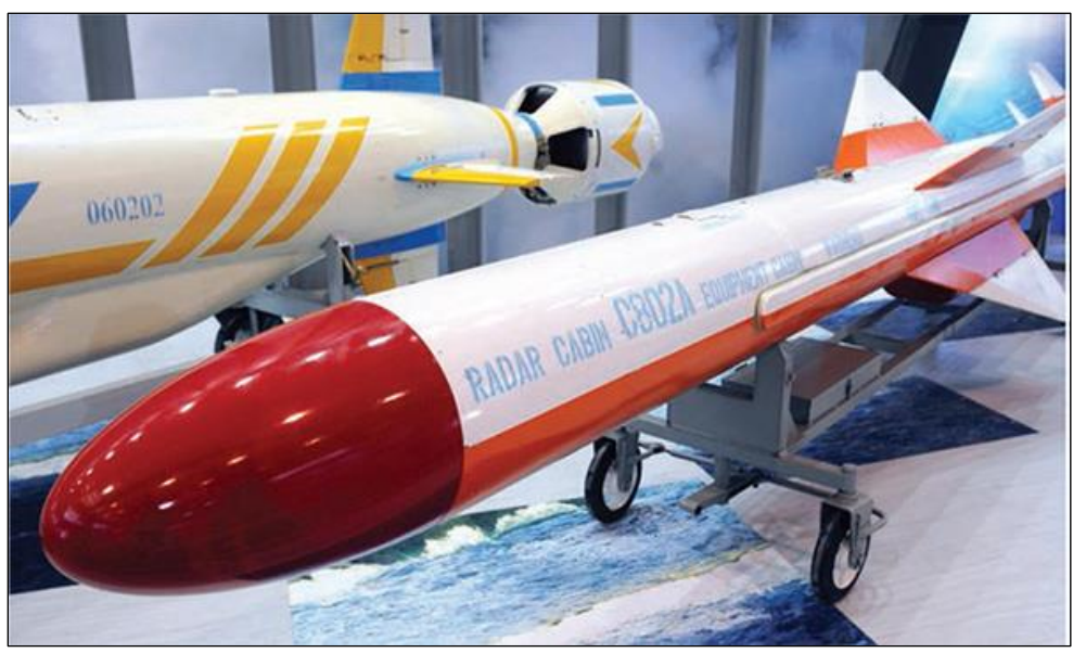
Figure 5. Reported Image of Anti-Ship Cruise Missile (ASCM)