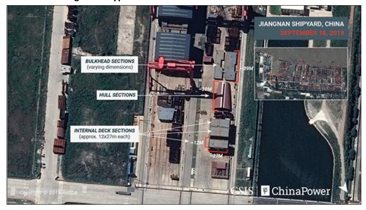
Figure 11. Type 002 Aircraft Carrier Under Construction

Press reports state that China's Type 002 carriers may have a displacement of 80,000 tons to 85,000 tons and will be equipped with electromagnetic catapults rather than a ski ramp, which will improve the range/payload capability of the fixed-wing aircraft that they operate.