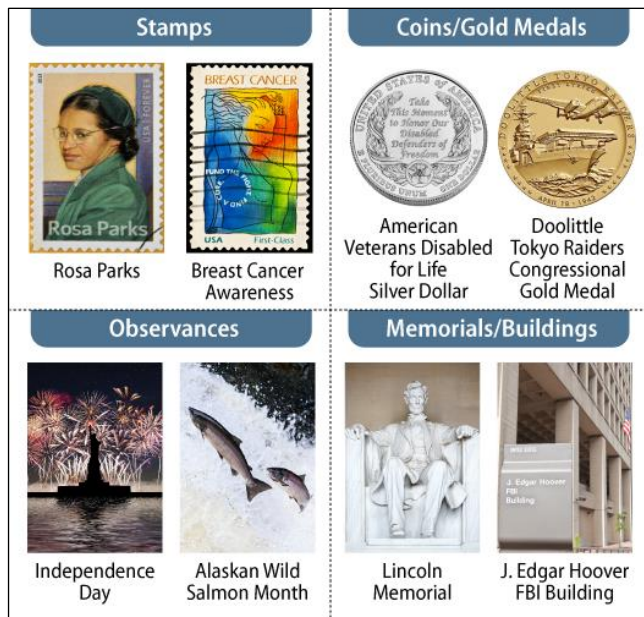
Figure 1. Types of Commemorative Legislation

Source: U.S. Mint, “Doolittle Tokyo Raiders,” at https://www.usmint.gov/coins/coin-medal-programs/medals/doolittle-tokyo-raiders ; and U.S. Mint, “American Veterans Disabled for Life Silver Dollar,” at https://www.usmint.gov/coins/coin-medal-programs/commemorative-coins/american-veterans-disabled-for-life .