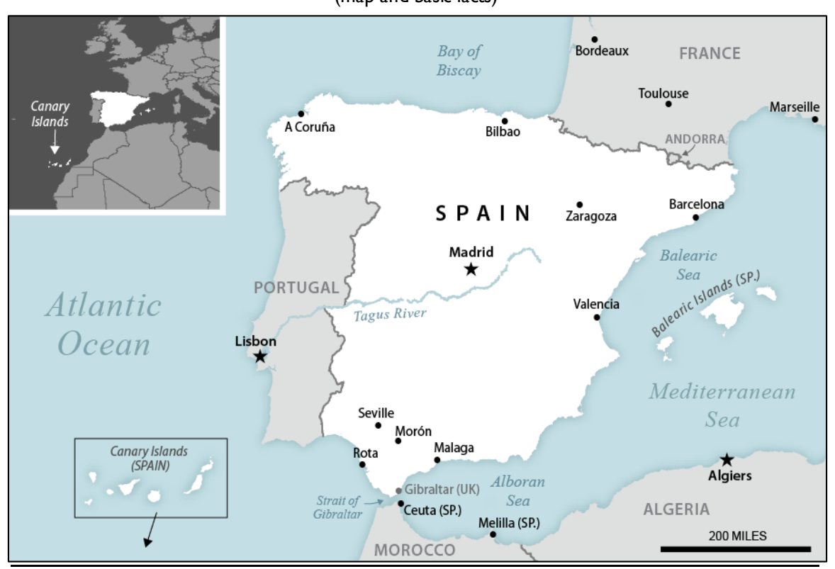
Figure 1. Spain (map and basic facts)

Many U.S. officials and Members of Congress consider Spain to be an important U.S. ally and one of the closest U.S. partners in Europe. Political developments in Spain, cooperation between the United States and Spain on security issues and counterterrorism, and U.S.-Spain economic ties are possible topics of continuing interest during the 116<sup>th</sup> Congress. Spain's experience with Coronavirus Disease 2019 (COVID-19) represents another area of mutual interest. Members of Congress may have an interest in considering the dimensions and dynamics of current issues in U.S.-Spain or U.S.-European relations, or with regard to NATO, in the course of oversight or legislative activities, or in the context of direct interactions with Spanish legislators and officials.