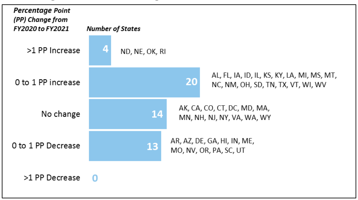
Figure 2. FMAP Rate Changes for States from FY2020 to FY2021

As shown in Figure 2 , from FY2020 to FY2021, the regular FMAP rates for 37 states are to change, whereas the regular FMAP rates for the remaining 14 states (including the District of Columbia) are to remain the same.<sup>13</sup>