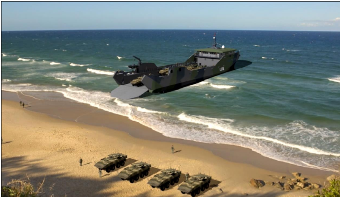
Figure 2. Notional Design for a LAW-Like Ship Artist's rendering