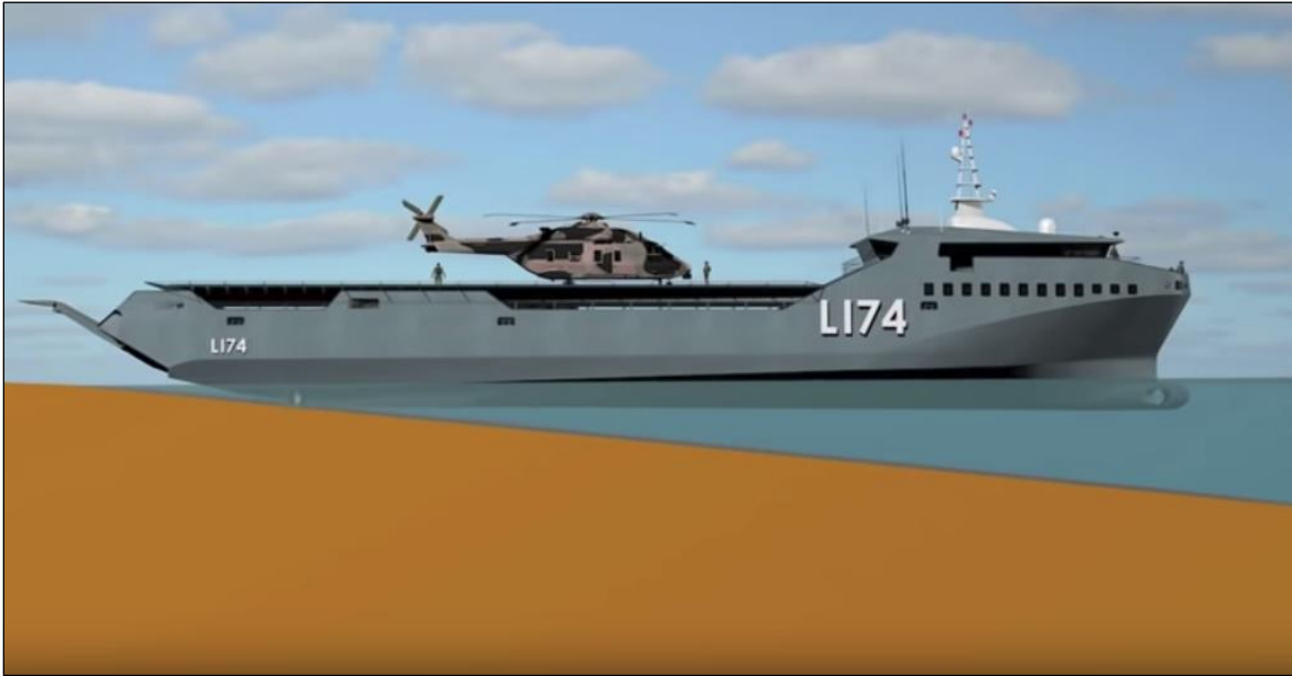
Figure 1. Notional Design for a LAW-Like Ship Artist's rendering

Source: Illustration accompanying Megan Eckstein, “Navy Researching New Class of Medium Amphibious Ship, New Logistics Ships,” USNI News , February 20, 2020. The article credits the image to Sea Transport Solutions, a naval architecture, consulting, surveying, and project-management firm.