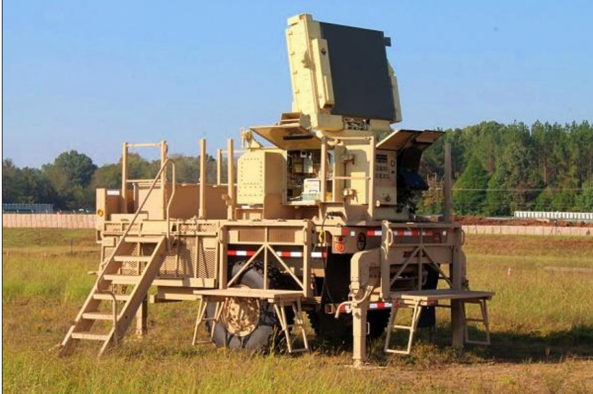
Figure 9. AN/MPQ-64 Sentinel A4 Radar