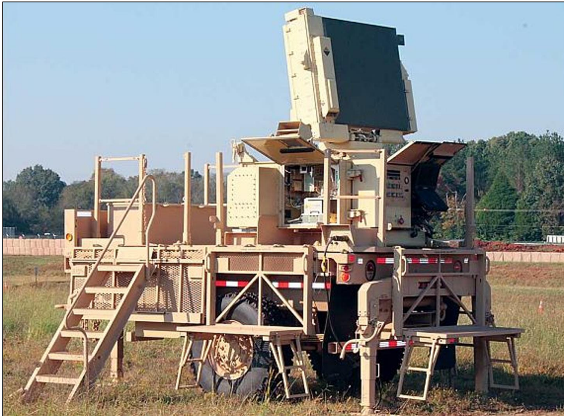
Figure 4. AN/MPQ-64 Sentinel A3 Radar