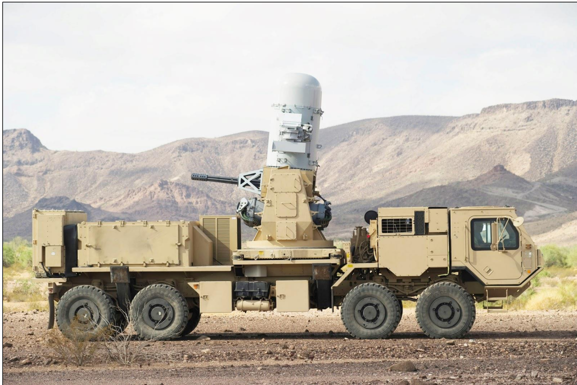
Figure 3. Land-Based Phalanx Weapons System (LPWS)