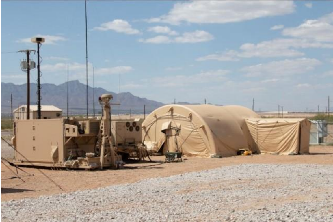
Figure 8. Integrated Air and Missile Defense Battle Command Systems (IBCS)