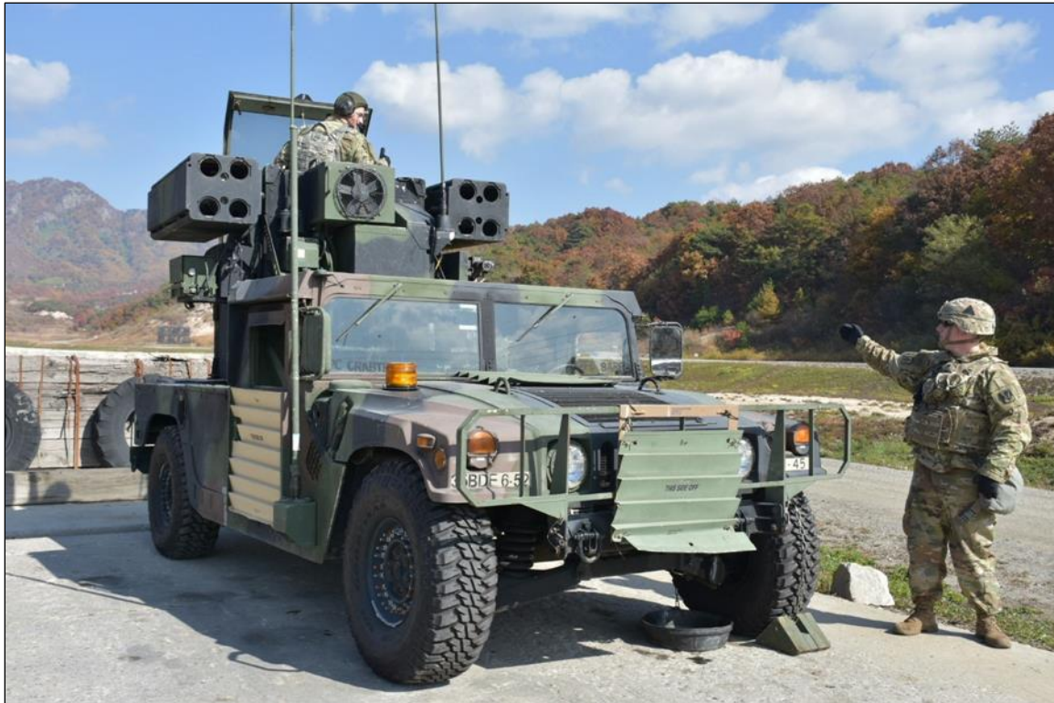
Figure 2. Avenger SHORAD System