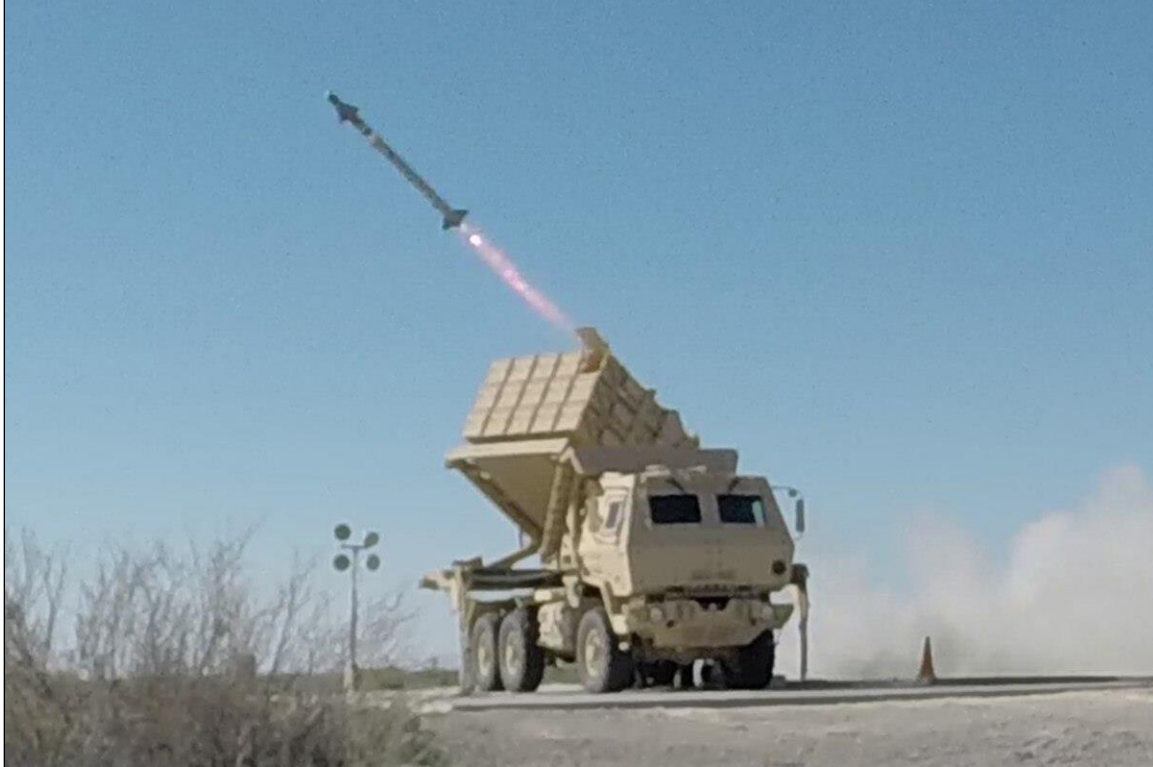
Figure 6. Prototype IFPC Inc 2 Launcher