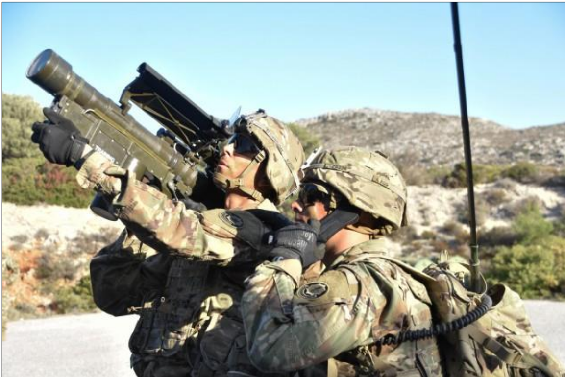
Figure 1. FIM-92 Stinger Man-Portable, Air Defense Missile System