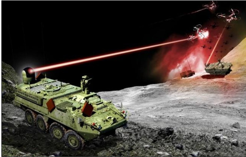
Figure 10. Artist's Conception: Directed Energy (DE) M-SHORAD