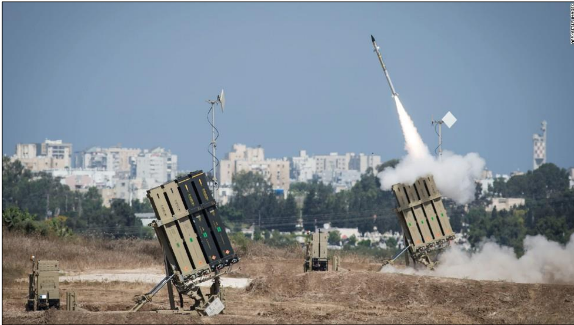
Figure 7. Israel’s Iron Dome System