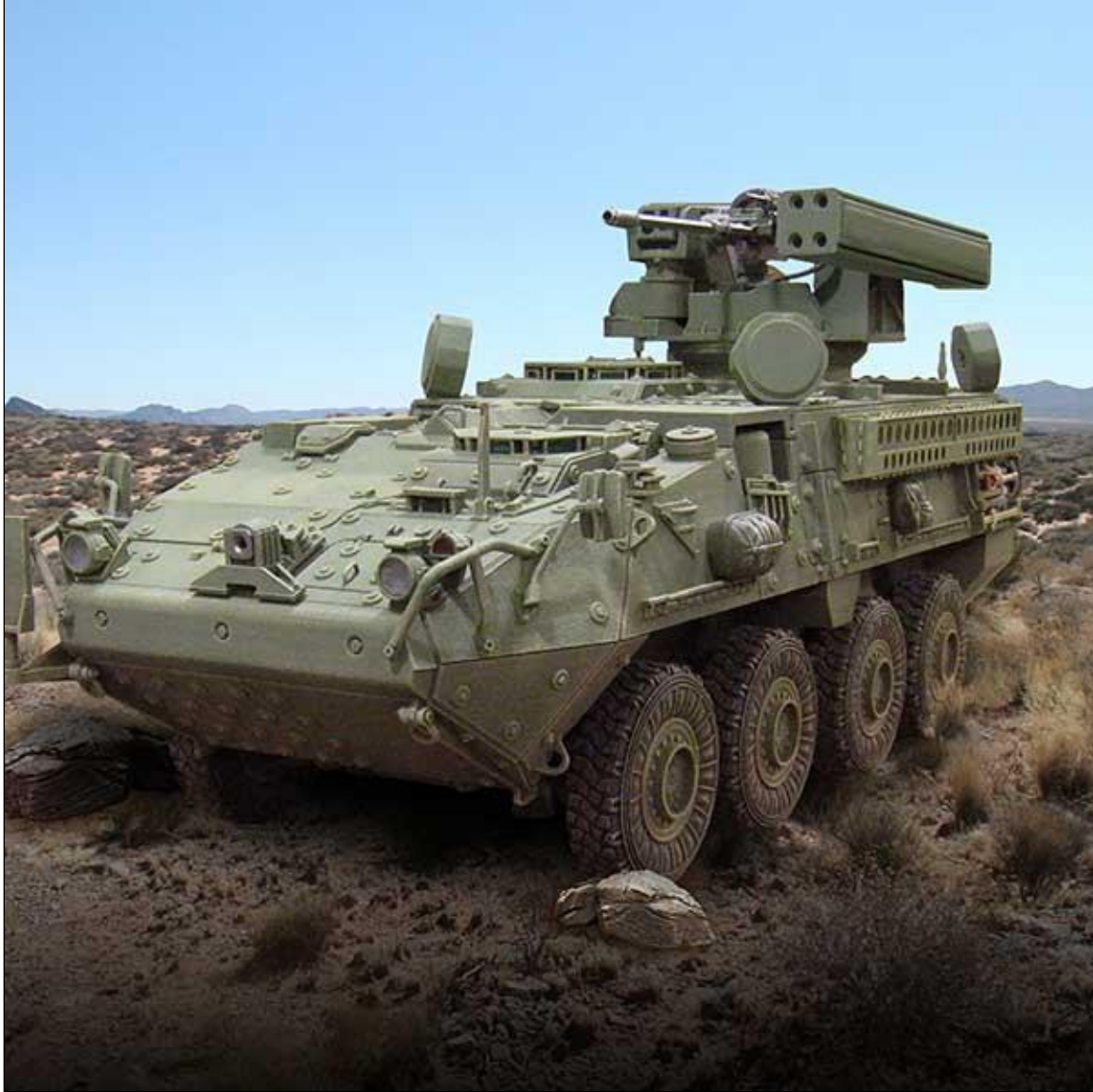
Figure 5.M SHORAD