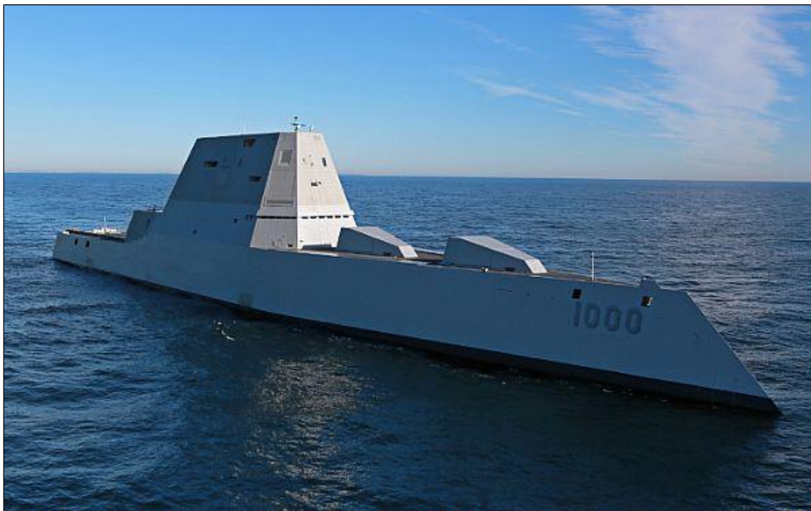
Figure A-1. DDG-1000 Class Destroyer