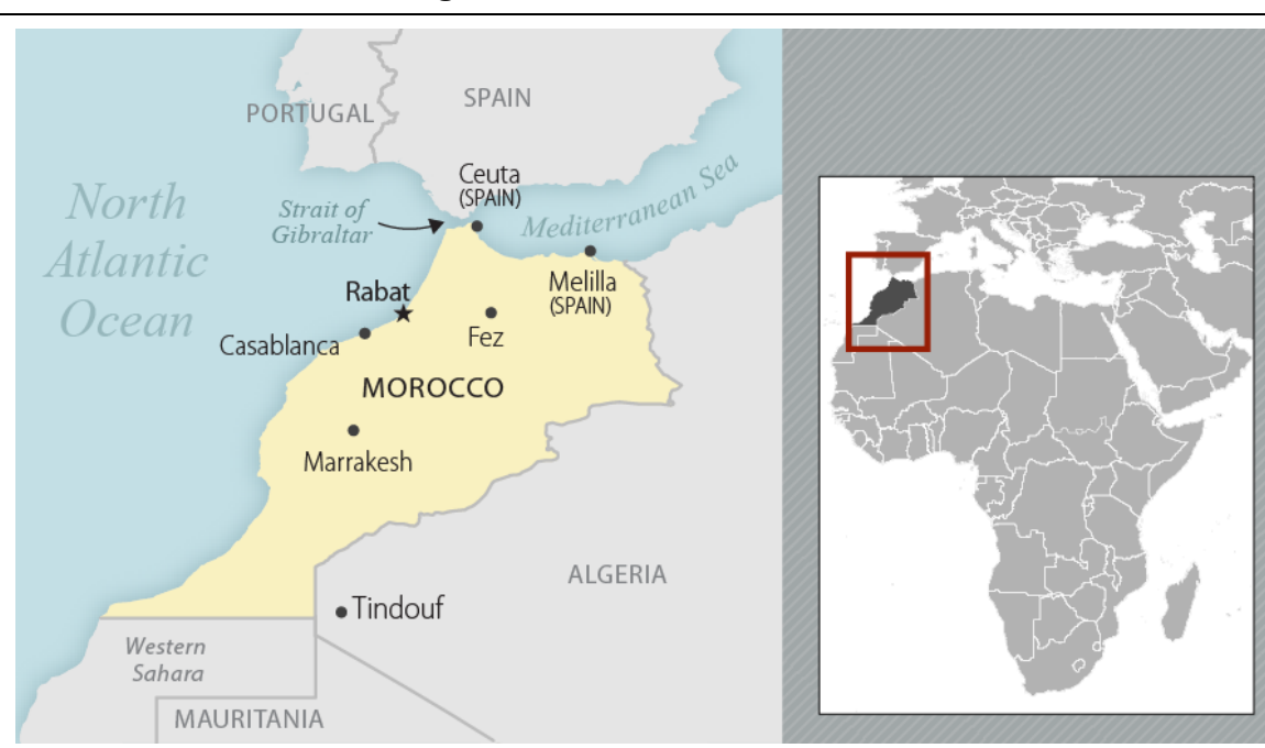
Figure 1. Morocco at a Glance

Disruptions in global food supply chains and travel caused by the pandemic have severe implications for Morocco's economy. The country is a net importer of agricultural products, and tourism has been the second-largest contributor to GDP in recent years (at approximately 11% of total GDP as of 2017, per Moroccan government statistics). <sup>16</sup> In late March 2020, the government established an emergency pandemic management fund of about $1 billion—financed by the government and voluntary contributions from private firms and citizens—to boost its healthcare capacity and assist economically vulnerable citizens. <sup>17</sup> Moroccan foundations have also donated personal protective equipment (PPE) to health workers.