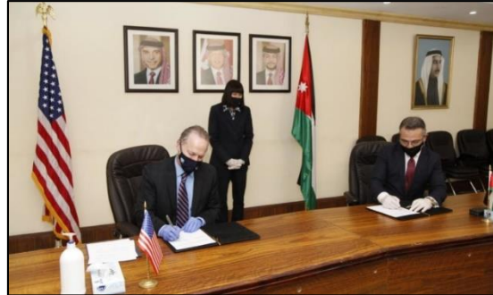
Figure 4. U.S., Jordan Sign Aid Agreement ($340 million assistance agreement signed May 2020)

The U.S. State Department estimates that, since large-scale U.S. aid to Syrian refugees began in FY2012, it has allocated more than $1.5 billion in humanitarian assistance from global accounts for programs in Jordan to meet the needs of Syrian refugees and, indirectly, to ease the burden on Jordan. 64 U.S. humanitarian assistance is provided both as cash assistance to refugees and through programs to meet their basic needs, such as child health care, education, water, and sanitation. To help prevent the spread of COVID-19 in Jordan, the United States has provided $8.4 million in aid, most of which is targeted toward Syrian refugees living in Jordan. 65