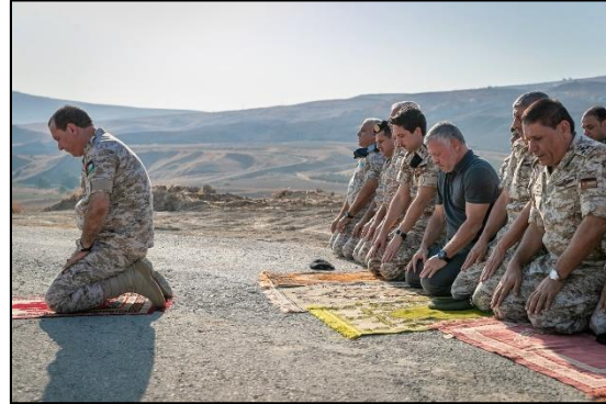
Figure 2. Jordanian Officials Pray at Area Recently Reclaimed from Israel

In late 2018, the king announced (via Twitter) that his government would not renew a provision in its 1994 peace treaty with Israel that allowed Israel access to the Jordanian territories of Baqoura and Al Ghumar, which are agricultural areas in northern and southern Jordan, respectively. 41 According to one Jordanian commentator, “Domestically, the King’s decision is a much-needed shot in the arm for the government at a time when it is facing public pressure over its unpopular economic policies.” 42 After several failed Israeli attempts to negotiate with Jordan over the renewal of access to the territories, Jordan ended its lease to Israel on November 10, 2019. A day later, King Abdullah, the Crown Prince, and several high level military officials made an official visit to Baqoura to publicly demonstrate Jordanian sovereignty over the area. 43