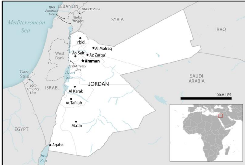
Figure I. Jordan at a Glance

Area: 89,342 sq. km. (34,495 sq. mi., slightly smaller than Indiana) Population: 10,458,413 (July 2018); Amman (capital): 4.008 million (2015) Ethnic Groups: Arabs 97%; other 2.6% (includes Armenians, Circassians) (2015) Religion: Sunni Muslim 97.2%; Christian 2.2%; Buddhist 0.4%; Hindu 0.1% Percent of Population Under Age 25: 54% (2018) Literacy: 95.4% (2015) Youth Unemployment (ages 15-24): 40.1% (2019) Source: Graphic created by CRS; facts from CIA World Factbook and World Bank.