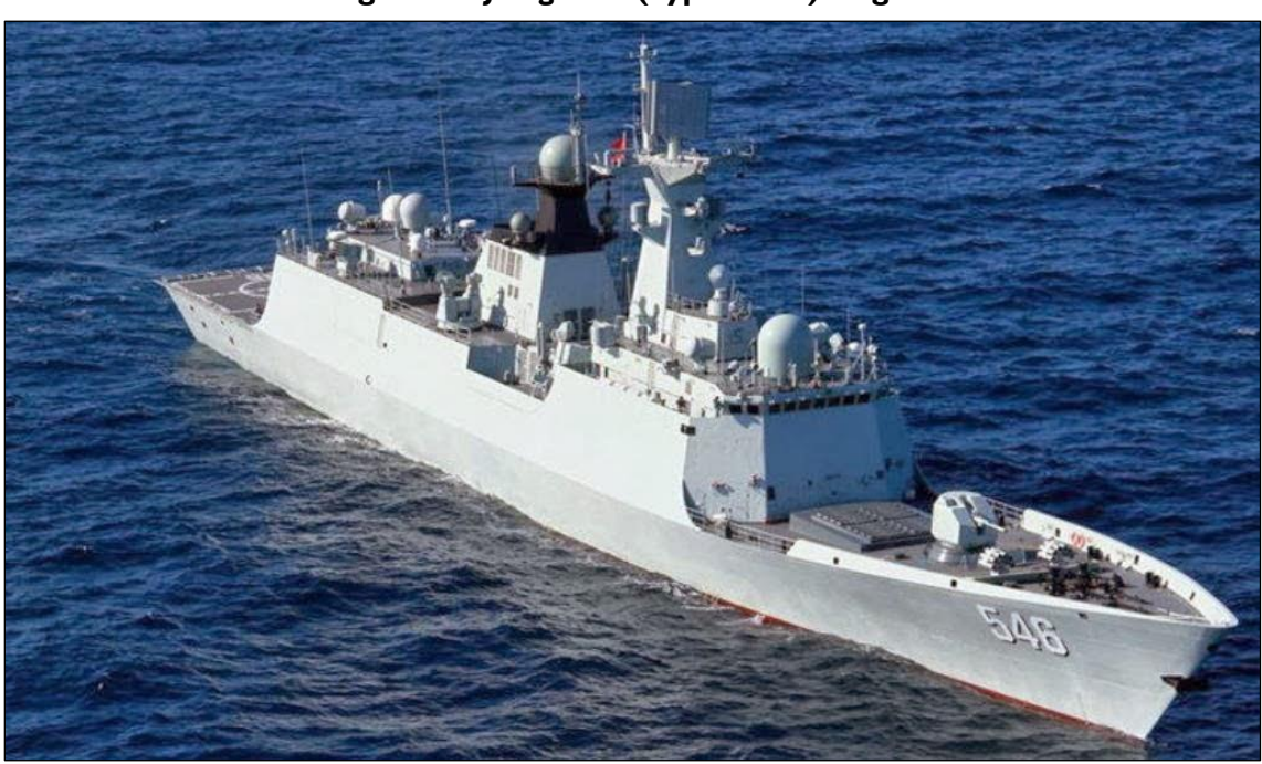
Figure 15. Jiangkai II (Type 054A) Frigate