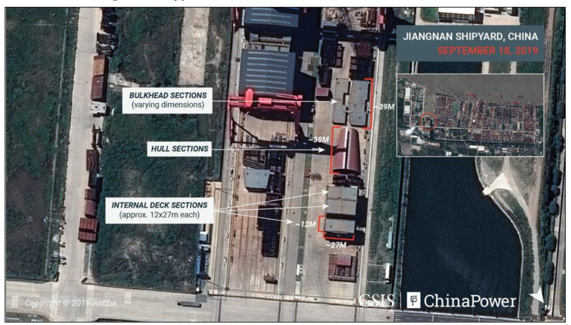
Figure 11. Type 002 Aircraft Carrier Under Construction