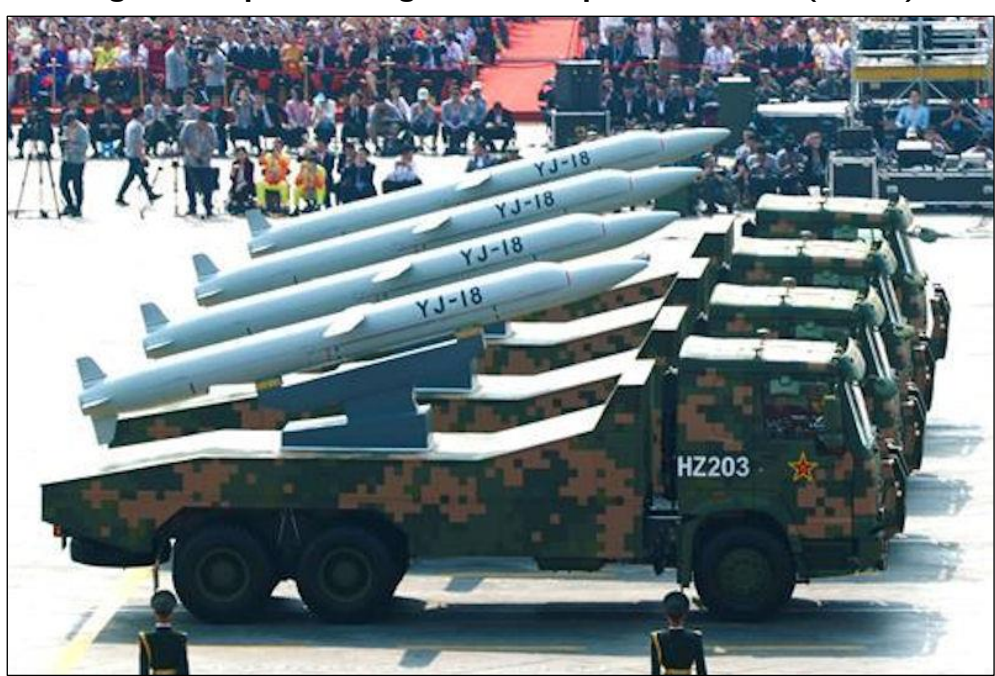
Figure 4. Reported Image of Anti-Ship Cruise Missile (ASCM)

Source: Photograph accompanying "YJ-18 Eagle Strike CH-SS-NX-13," GlobalSecurity.org, updated October 1, 2019. The article states: "A grand military parade was held in Beijing on 01 October 2019 to mark the People's Republic of China's 70th founding anniversary.... One weapon featured was a new generation of anti-ship missiles called YJ-18. China unveiled YJ-18/18A anti-ship cruise missiles in the National Day military parade in central Beijing.")