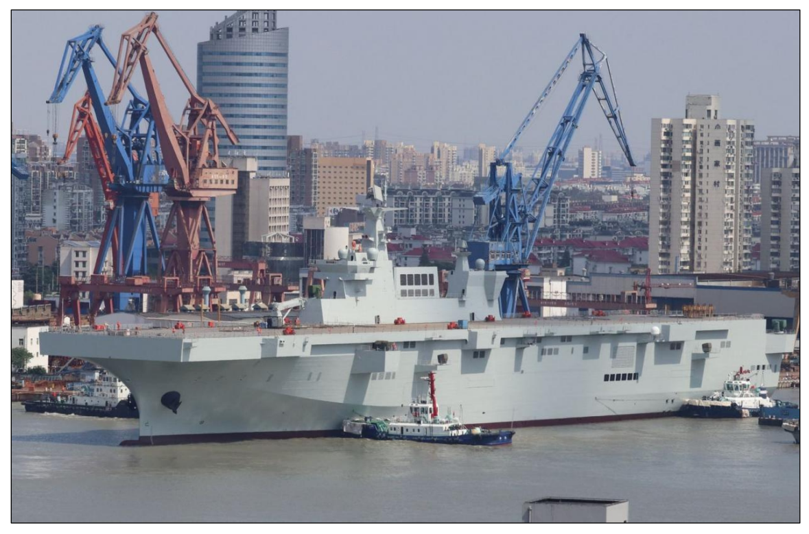
Figure 18. Type 075 Amphibious Assault Ship

rising from ship and subsequent smoke stains at the ship's stern ( Figure 21 ). On April 22, 2020, China launched the second ship in the class.<sup>52</sup> ONI states that as of February 2020, three Type 075s, including the first one, were under construction.<sup>53</sup>