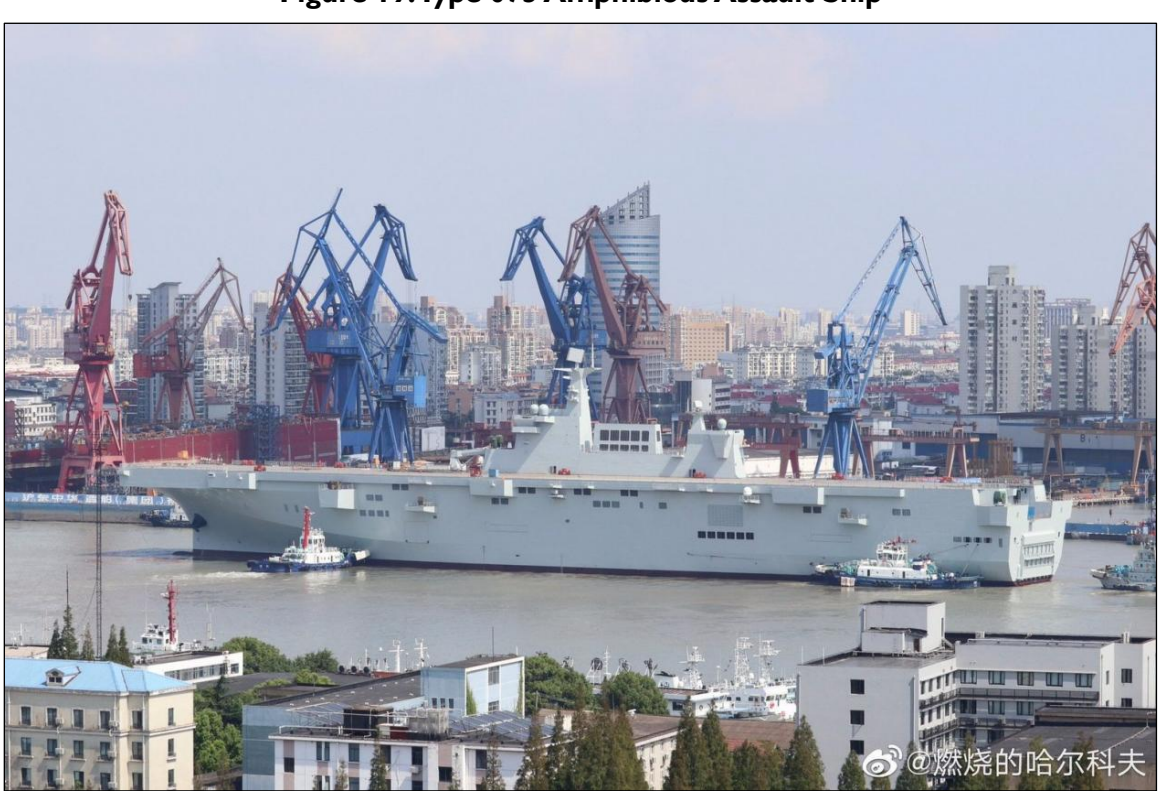
Figure 19. Type 075 Amphibious Assault Ship