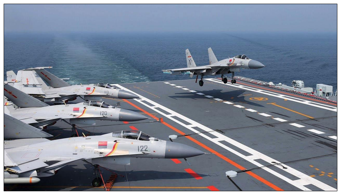
Figure 12. J-15 Flying Shark Carrier-Capable Fighter

classes as China's technological advancement in naval design has begun to approach a level commensurate with, and in some cases exceeding, that of other modern navies."<sup>39</sup> China is also upgrading its older surface combatants with new weapons and other equipment.<sup>40</sup>