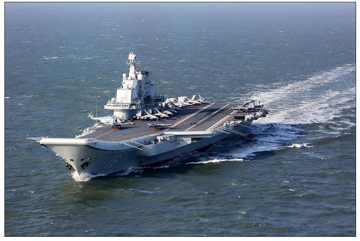
Figure 9. Liaoning (Type 001) Aircraft Carrier

Liaoning is a refurbished ex-Ukrainian aircraft carrier that China purchased from Ukraine in 1998 as an unfinished ship.<sup>30</sup> It is conventionally powered, has an estimated full load displacement of 60,000 to 66,000 tons, and reportedly can accommodate an air wing of 30 or more fixed-wing airplanes and helicopters, including 24 fighters. The Liaoning lacks aircraft catapults and instead launches fixed-wing airplanes off the ship's bow using an inclined "ski ramp."