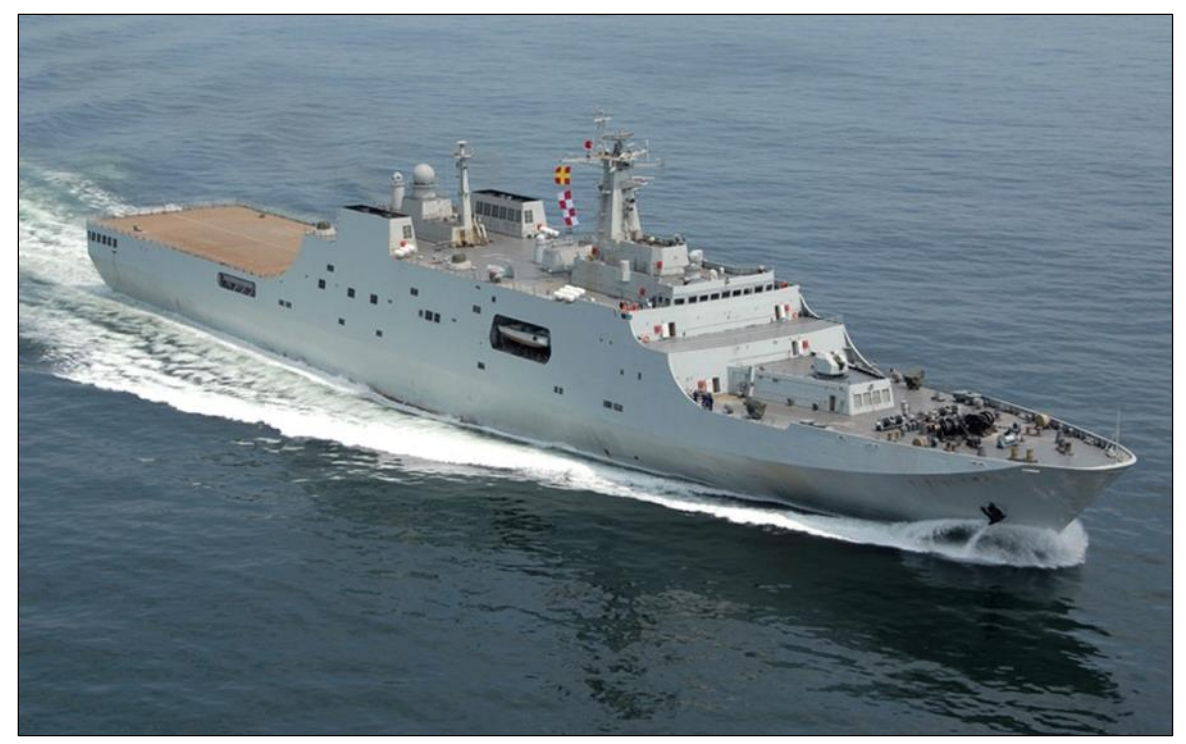
Figure 17. Yuzhao (Type 071) Amphibious Ship

China's new Yuzhao or Type 071 amphibious ships ( Figure 17 ) have an estimated displacement of more than 19,855 tons,<sup>48</sup> compared to about 25,900 tons for the U.S. Navy's new San Antonio (LPD-17) class amphibious ships. The fifth Type 071 ship was reportedly commissioned into service in September 2018, and at least two more reportedly are under construction.