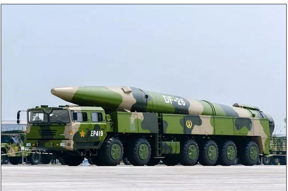
Figure 2. DF-26 Multi-Role Intermediate-Range Ballistic Missile (IRBM)