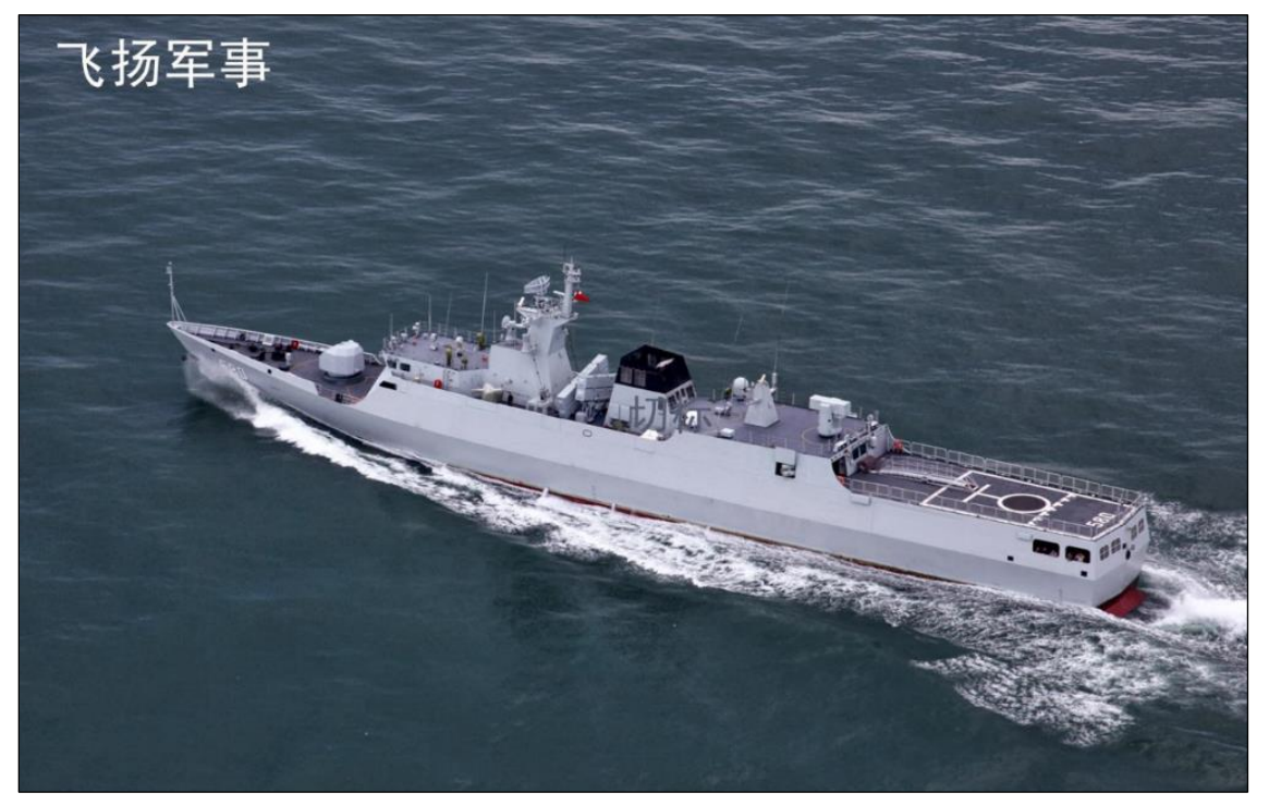
Figure 16. Jingdao (Type 056) Corvette