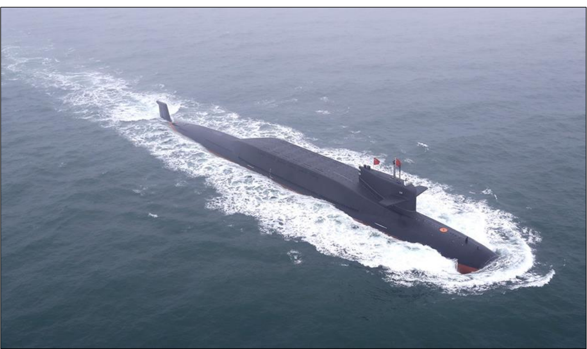
Figure 8. Jin (Type 094) Ballistic Missile Submarine (SSBN)