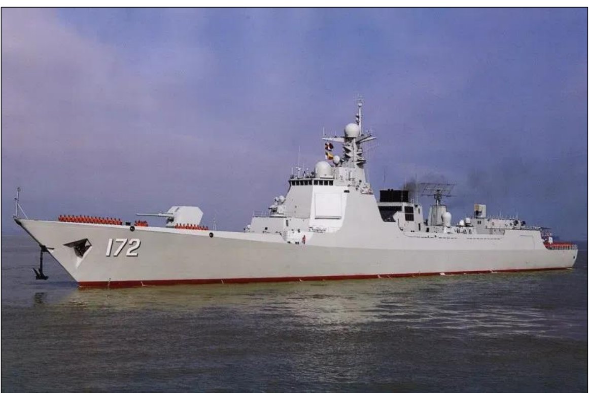
Figure 14. Luyang III (Type 052D) Destroyer