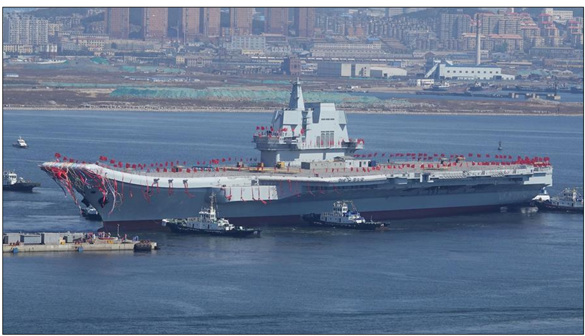
Figure 10. Shandong (Type 001A) Aircraft Carrier