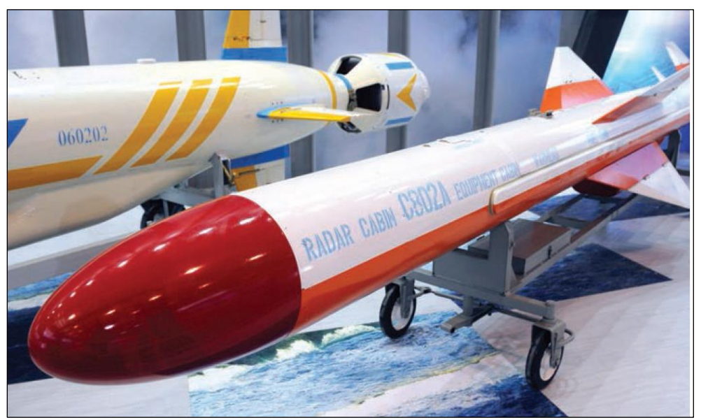
Figure 5. Reported Image of Anti-Ship Cruise Missile (ASCM)

Source: Photograph accompanying "YJ-18 Eagle Strike CH-SS-NX-13," GlobalSecurity.org, updated October 1, 2019. The article states: "A grand military parade was held in Beijing on 01 October 2019 to mark the People's Republic of China's 70th founding anniversary.... One weapon featured was a new generation of anti-ship missiles called YJ-18. China unveiled YJ-18/18A anti-ship cruise missiles in the National Day military parade in central Beijing.")