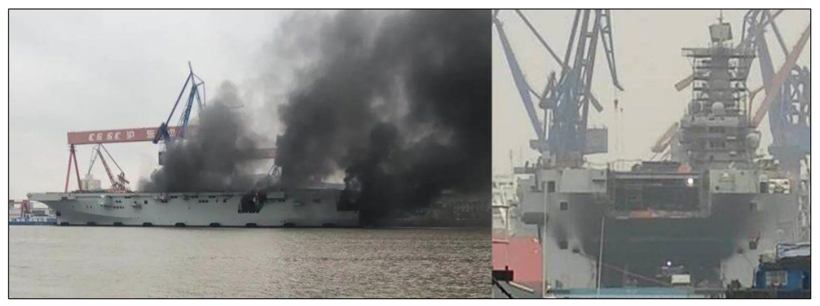
Figure 21. Type 075 Amphibious Assault Ship During and After Reported Fire

years of the 30-year shipbuilding plan.<sup>57</sup> In contrast, China does not release a navy force-level goal or detailed information about planned ship procurement rates, planned total ship procurement quantities, planned ship retirements, and resulting projected force levels. It is possible that the ultimate size and composition of China's navy is an unsettled and evolving issue even among Chinese military and political leaders.