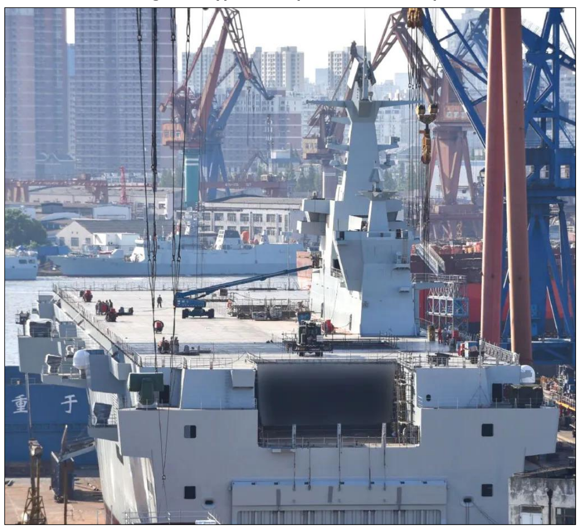
Figure 20. Type 075 Amphibious Assault Ship