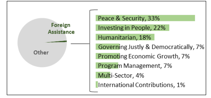
Figure 1. Foreign Aid as a Portion of Federal Budget Authority and by Sector, FY2018 (net obligations)

Note: FY2018 data are the most recent comprehensive data available.