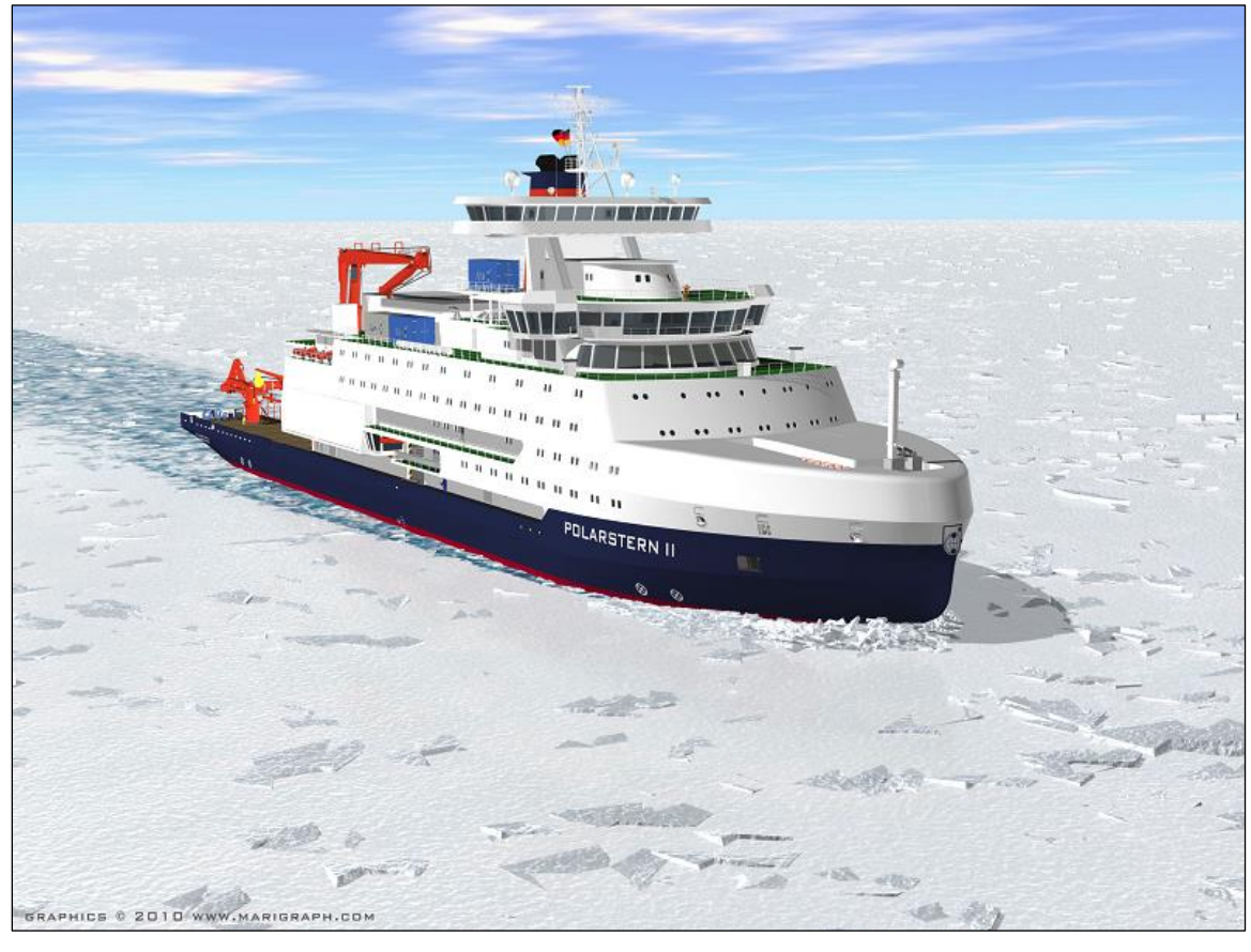
Figure 4. Rendering of SDC Concept Design for Polarstern II

stated that the design at that point was somewhat larger, with a length of 145 meters (about 476 feet), a beam of 27.3 meters (about 89.6 feet), a draft of about 11 meters (about 36.1 feet), and a displacement (including payload) of about 26,000 tons. These figures suggest that SDC's somewhat smaller concept design for Polarstern II might have a displacement (including payload) of something less than 26,000 tons, and perhaps closer to 23,000 tons.