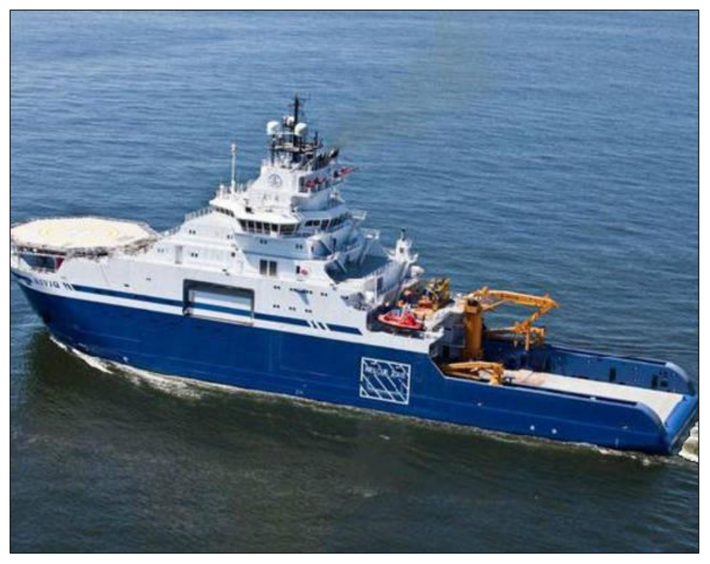
Figure 5. Aiviq