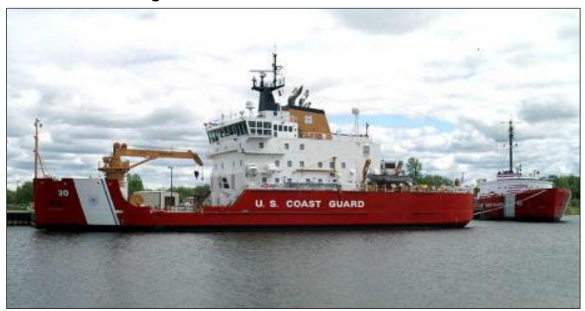
Figure E-I. Great Lakes Icebreaker Mackinaw