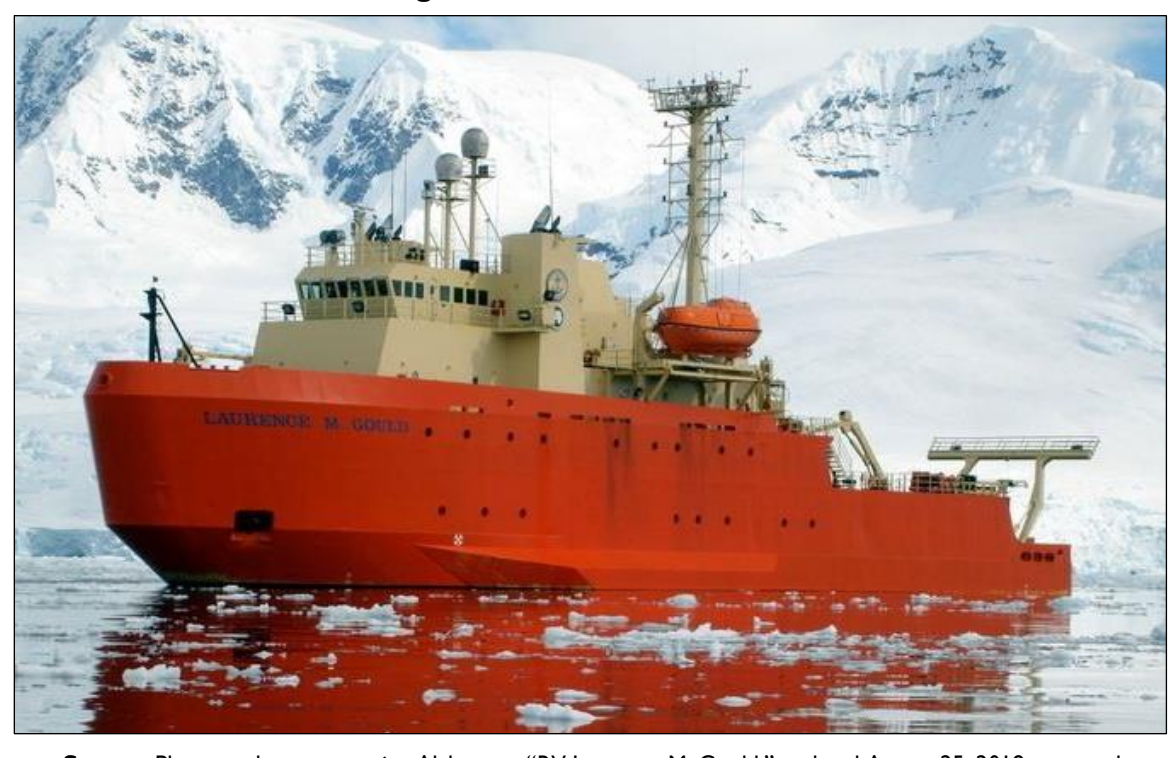
Figure A-5. Laurence M. Gould

Like Palmer , the polar research and supply ship Laurence M. Gould ( Figure A-5 ) was built for NSF by North American Shipping. It was completed in 1997 and is operated for NSF on a long-term charter from ECO. It is 230 feet long and has a displacement of about 3,800 tons. It has a crew of 16 and can embark a scientific staff of 26 to 28 (with a capacity for 9 more in a berthing van). It can break ice up to 1 foot thick with continuous forward motion. Like Palmer , it was built to support NSF operations in the Antarctic, particularly operations at Palmer Station on the Antarctic Peninsula.