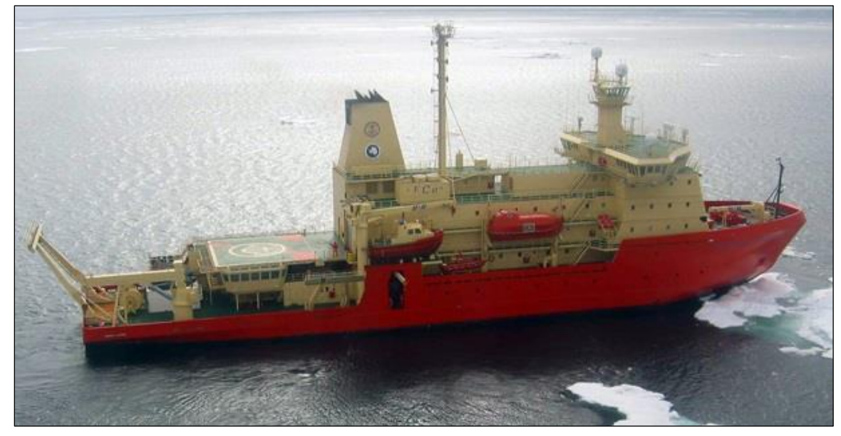
Figure A-4. Nathaniel B. Palmer

Nathaniel B. Palmer ( Figure A-4 ) was built for the NSF in 1992 by North American Shipbuilding, of Larose, LA.