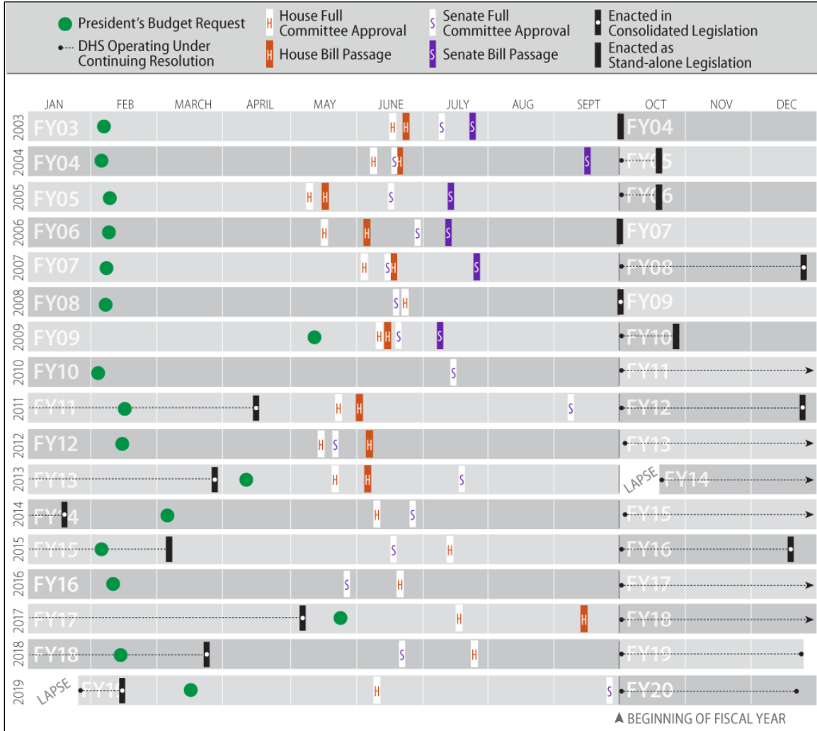
Figure I. DHS Appropriations Legislative Timing, FY2004-FY2019