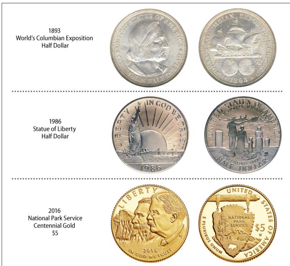
Figure 2. Examples of Commemorative Coin Designs