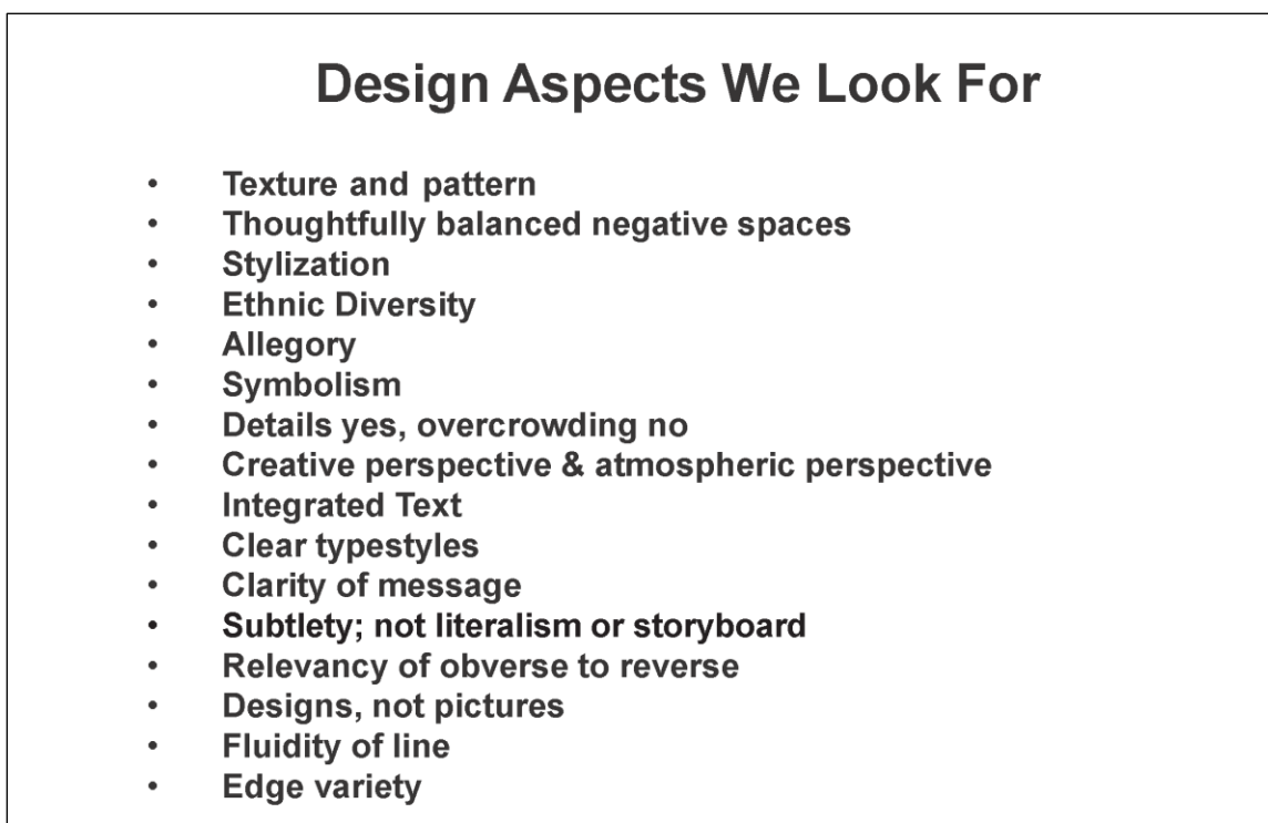
Figure 1. Citizens Coinage Advisory Committee Design Elements