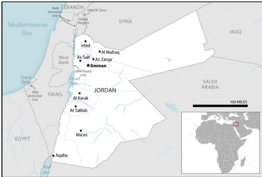
Figure 1. Jordan at a Glance

Area: 89,342 sq. km. (34,495 sq. mi., slightly smaller than Indiana)