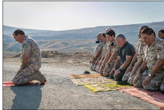
Figure 3. Jordanian Officials Pray at Recently Reclaimed Area from Israel